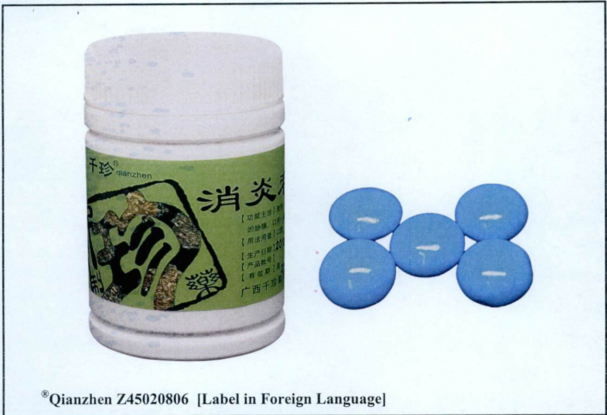
®Qianzhen Z45020806 [Label in Foreign Language]