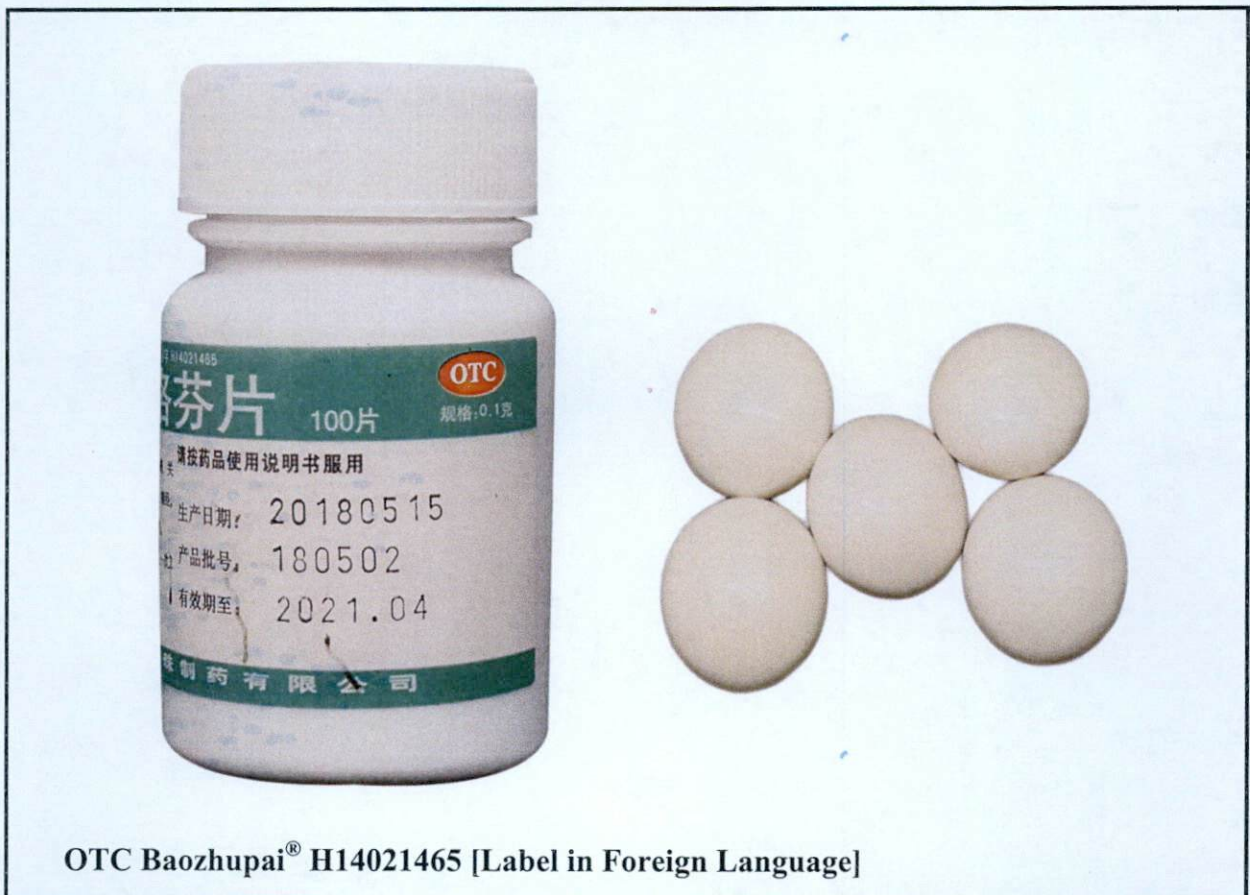
OTC Baozhupai® H14021465 [Label in Foreign Language]