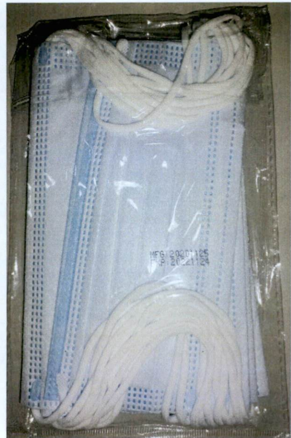
Figure 1. Unnotified Disposable Face Mask with Comfortable Earloop