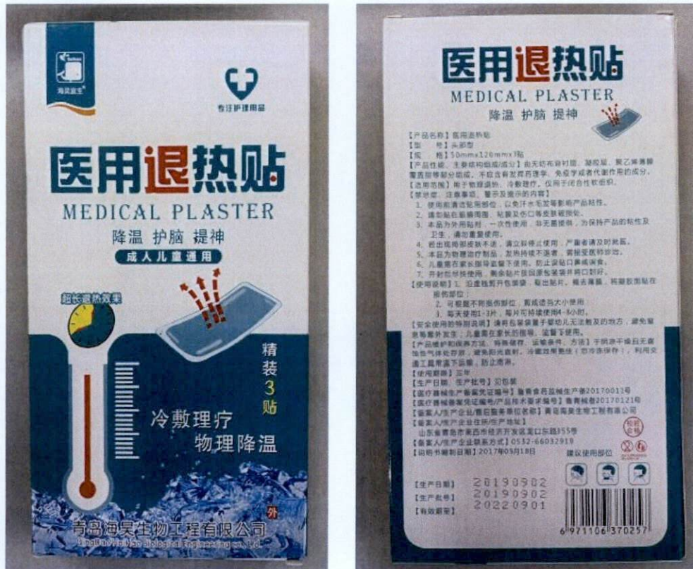
Figure 1. Unregistered Medical Plaster (in foreign characters)

The Food and Drug Administration (FDA) warns all healthcare professionals and the general public NOT TO PURCHASE AND USE the following unregistered medical device products in foreign characters: