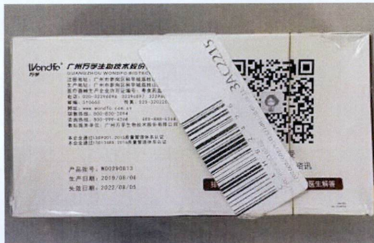
Figure 2. Unregistered Pregnancy Test Kit (in foreign characters)