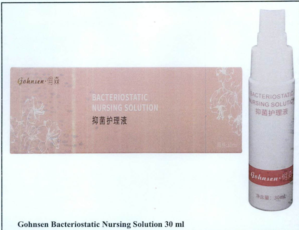
Gohnsen Bacteriostatic Nursing Solution 30 ml