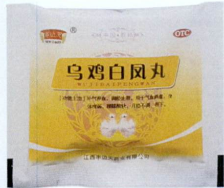
OTC Newwomen Wuji Baifeng Wan [as reflected in the package insert]