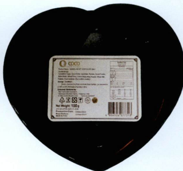
Figure 4. Unregistered COCO FALL INLOVE WITH Manisa Heart Chocolate