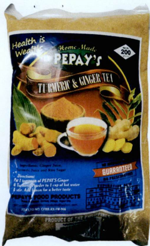
Figure 2. Unregistered PEPAY'S Turmeric and Ginger Tea