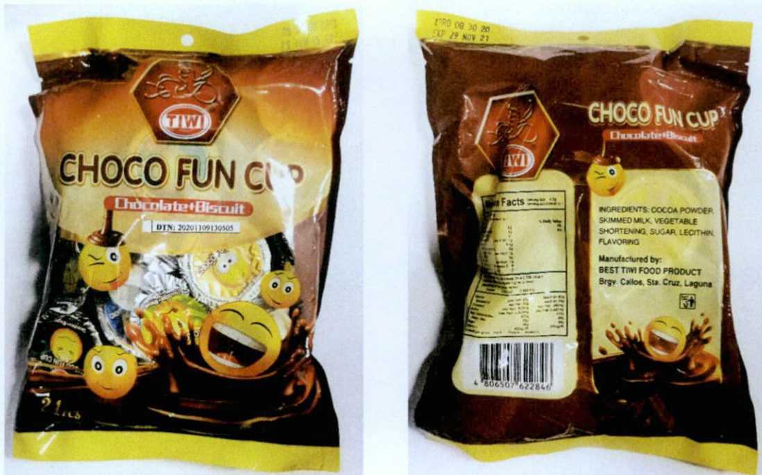
Figure 1. Unregistered TIWI Choco Fun Cup Chocolate + Biscuit

The Food and Drug Administration (FDA) warns all healthcare professionals and the general public NOT TO PURCHASE AND CONSUME the following unregistered food products: