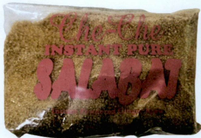
Figure 3. Unregistered CHE-CHE Instant Pure Salabat Instant Powdered Ginger Brew