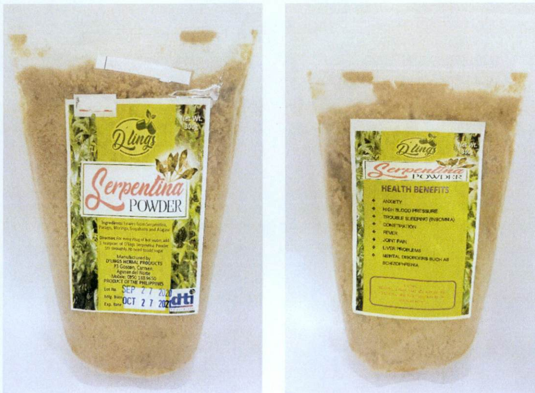
Figure 1. Unregistered D'LINGS Serpentina Powder

The Food and Drug Administration (FDA) warns all healthcare professionals and the general public NOT TO PURCHASE AND CONSUME the following unregistered food products: