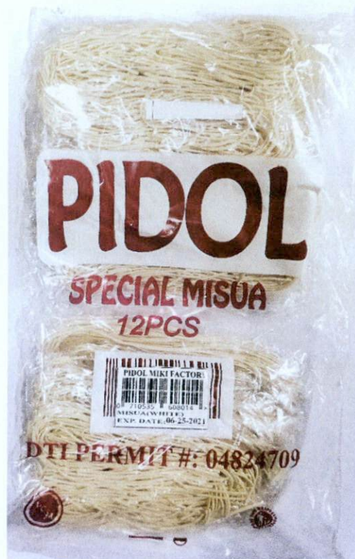
Figure 5. Unregistered PIDOL Special Misua (White)