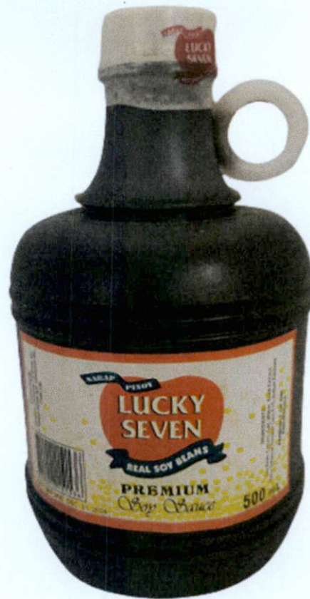
Figure 4. Unregistered LUCKY SEVEN Premium Soy Sauce