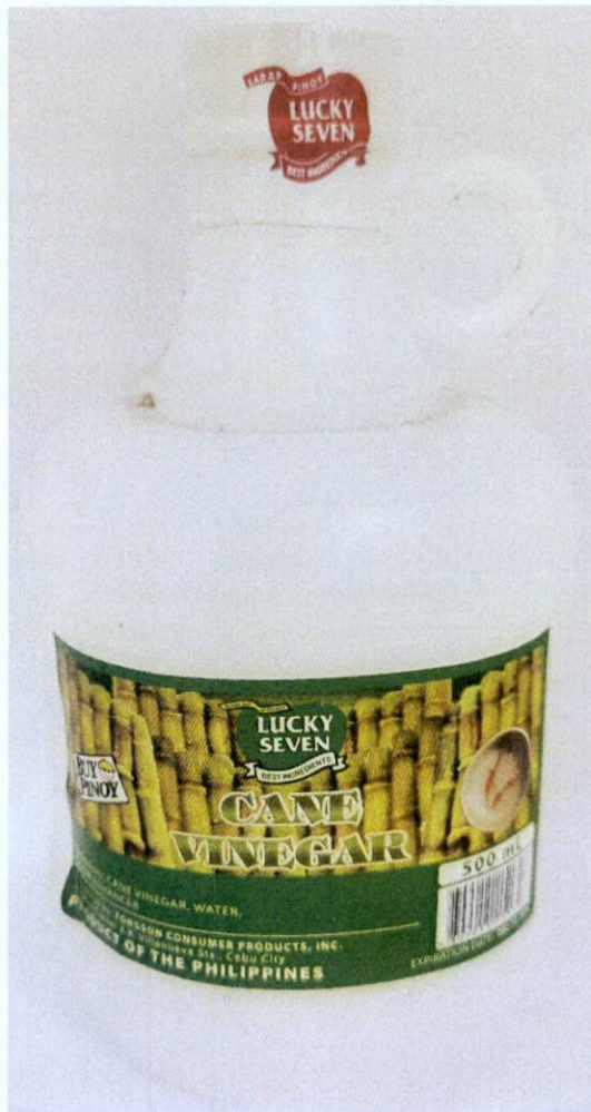
Figure 3. Unregistered LUCKY SEVEN Cane Vinegar