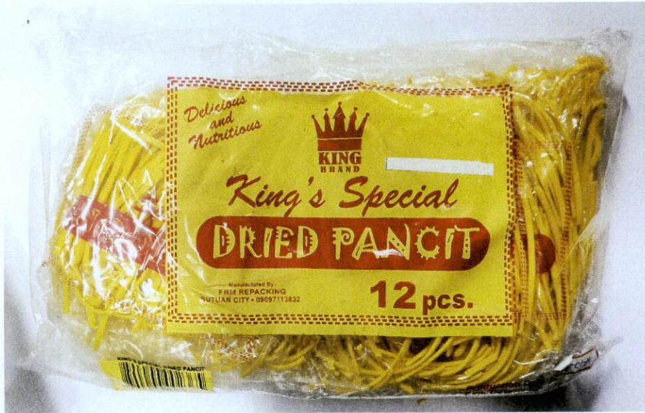
Figure 2. Unregistered KING BRAND King's Special Dried Pancit