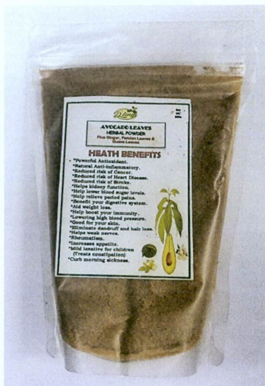
Figure 5. Unregistered D'LINGS Avocado Leaves Herbal Powder Plus Ginger, Pandan Leaves & Guava Leaves