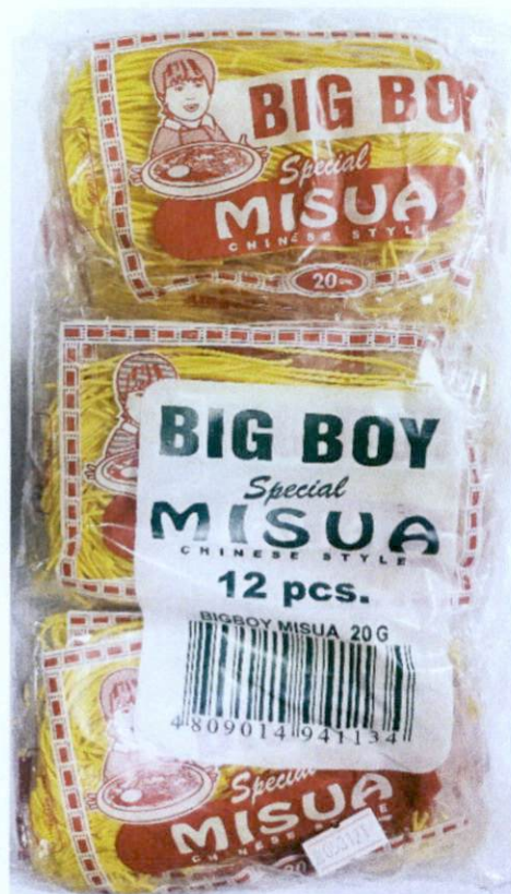
Figure 3. Unregistered BIG BOY Special Misua Chinese Style