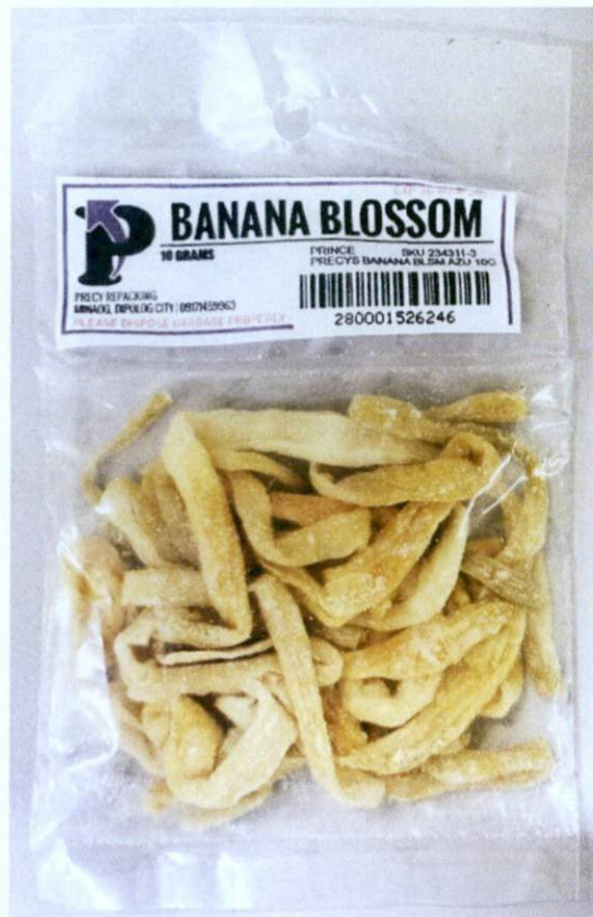
Figure 1. Unregistered PRECY REPACKING Banana Blossoms

The Food and Drug Administration (FDA) warns all healthcare professionals and the general public NOT TO PURCHASE AND CONSUME the following unregistered food products: