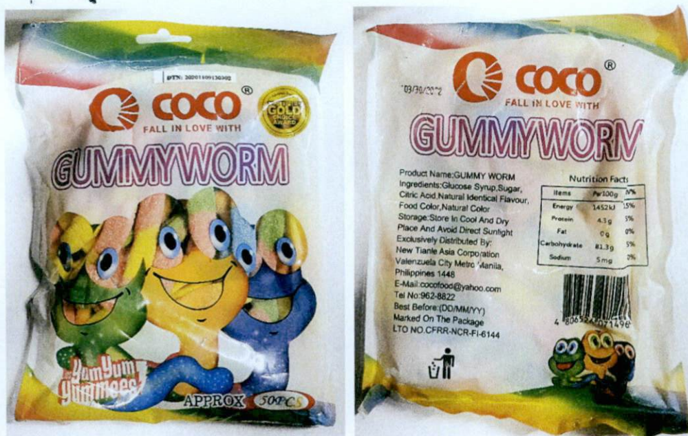
Figure 4. Unregistered COCO FALL IN LOVE with Gummy Worm