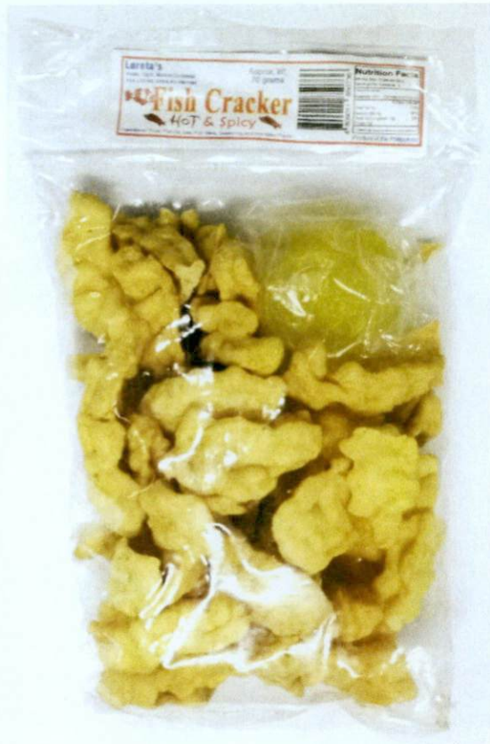
Figure 2. Unregistered LORETA'S Fish Cracker Hot & Spicy