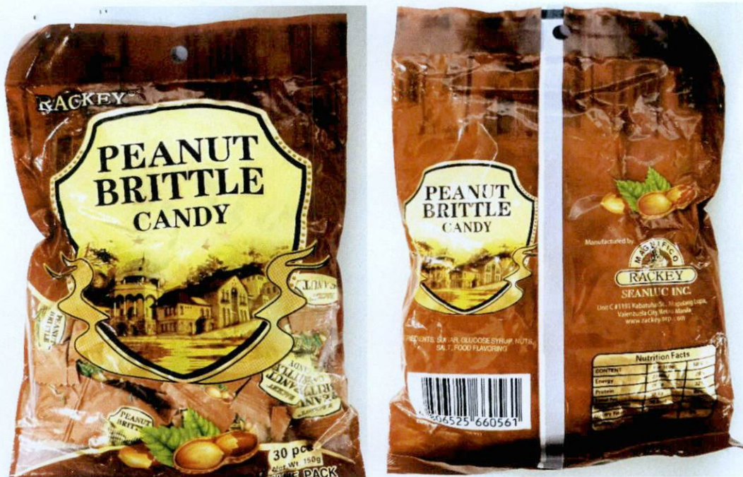
Figure 4. Unregistered RACKEY Peanut Brittle Candy