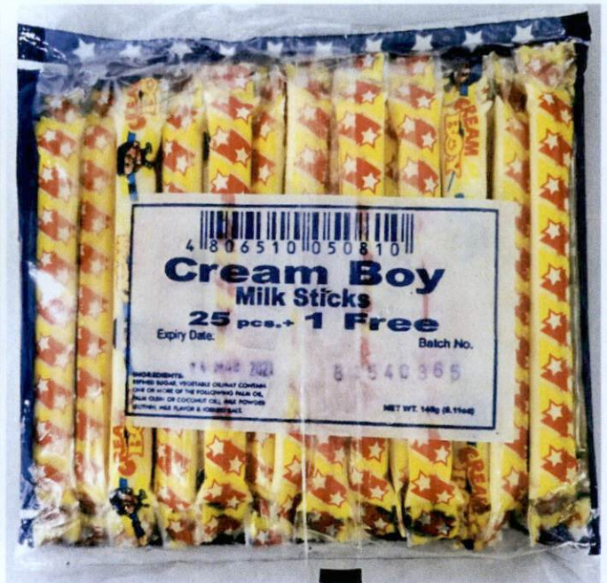
Figure 3. Unregistered CREAM BOY FUN STICKS Milk Sticks