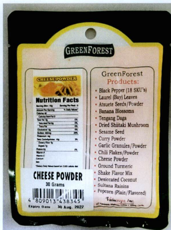
Figure 1. Unregistered GREEN FOREST Cheese Powder