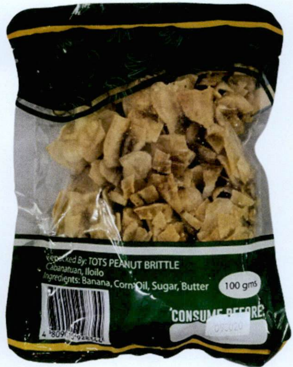
Figure 2. Unregistered TOT'S Banana Chips