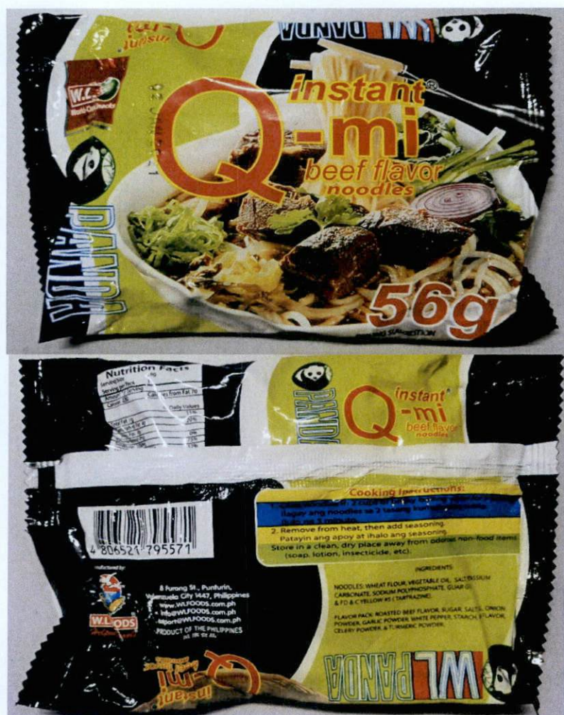
Figure 5. Unregistered WL PANDA Instant Q-Mi Beef Flavor Noodles