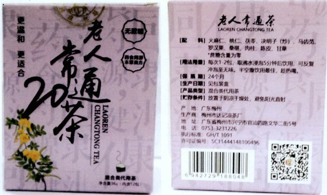
Figure 2. Unregistered LAOREN CHANGTONG Tea (In Foreign Language)