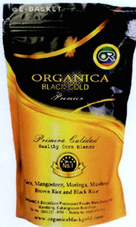
Figure 3. Unregistered ORGANICA Black Gold Coffee