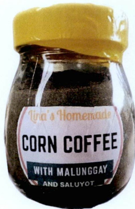
Figure 4. Unregistered LINA'S HOMEMADE Corn Coffee with Malunggay and Saluyot