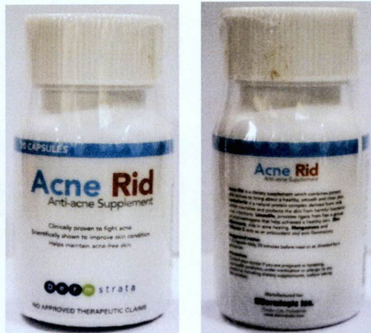
Figure 1. Unregistered ACNERID Anti-acne Supplement

The Food and Drug Administration (FDA) warns all healthcare professionals and the general public NOT TO PURCHASE AND CONSUME the following unregistered food supplement and food products: