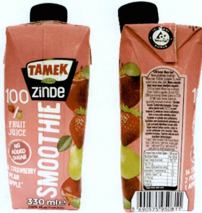
Figure 2. Unregistered TAMEK ZINDE SMOOTHIE Strawberry-Pear-Apple Multi Fruit Juice