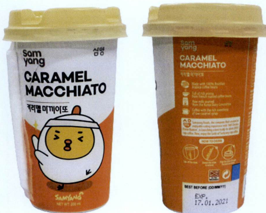
Figure 3. Unregistered SAMYANG Caramel Macchiato Coffee Drink