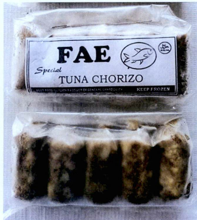
Figure 5. Unregistered FAE Special Tuna Chorizo