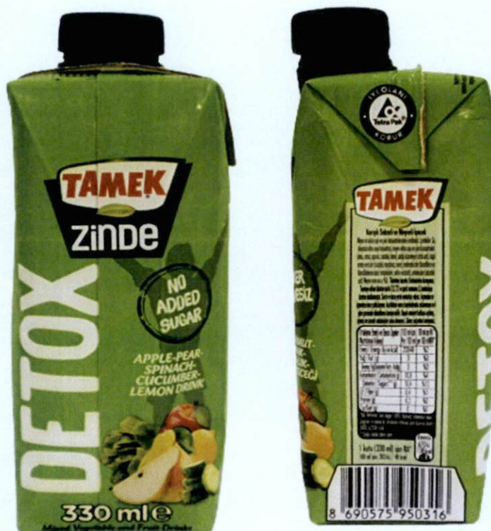
Figure 1. Unregistered TAMEK ZINDE DETOX Apple-Pear-Spinach-Cucumber-Lemon Drink Mixed Vegetable and Fruit Drink

The Food and Drug Administration (FDA) warns all healthcare professionals and the general public NOT TO PURCHASE AND CONSUME the following unregistered food products: