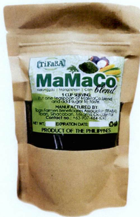
Figure 4. Unregistered TIFABA MAMACO Blend Coffee