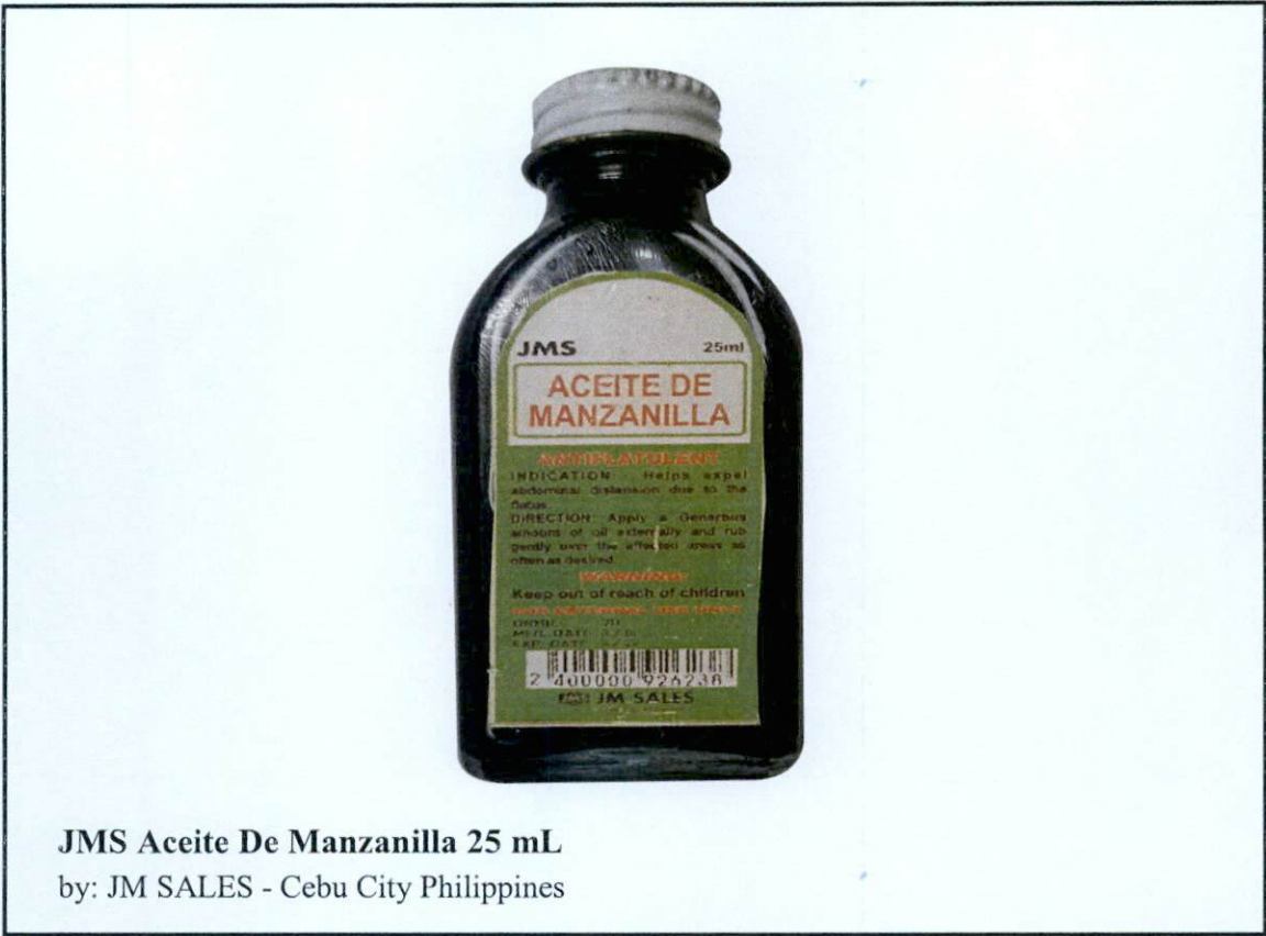
JMS Aceite De Manzanilla 25 mL by: JM SALES - Cebu City Philippines