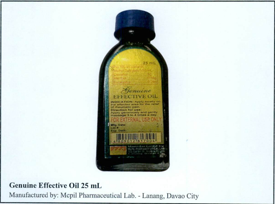
Genuine Effective Oil 25 mL Manufactured by: Mcpil Pharmaceutical Lab. - Lanang, Davao City