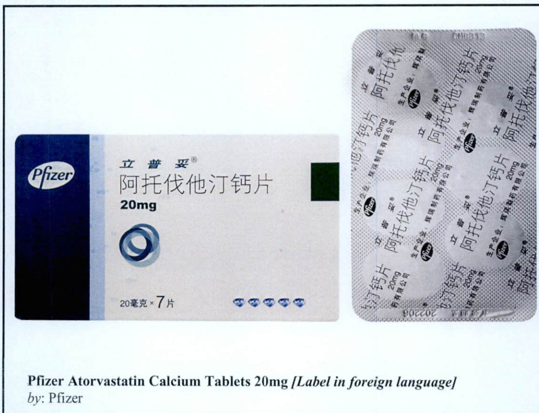
Pfizer Atorvastatin Calcium Tablets 20mg [ Label in foreign language ] by: Pfizer

The Food and Drug Administration (FDA) advises the public against the purchase and use of the following unregistered drug products: