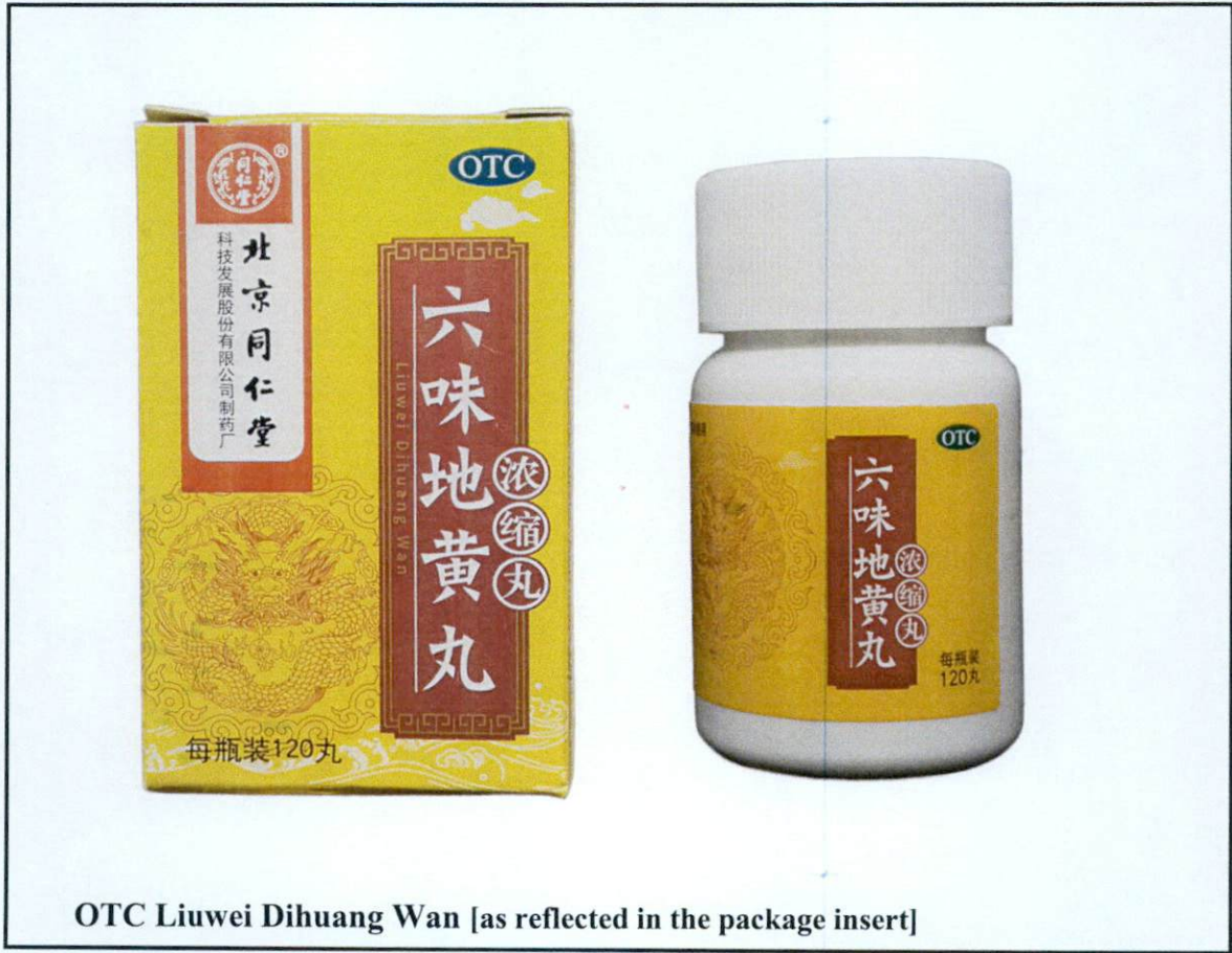
OTC Liuwei Dihuang Wan [as reflected in the package insert]