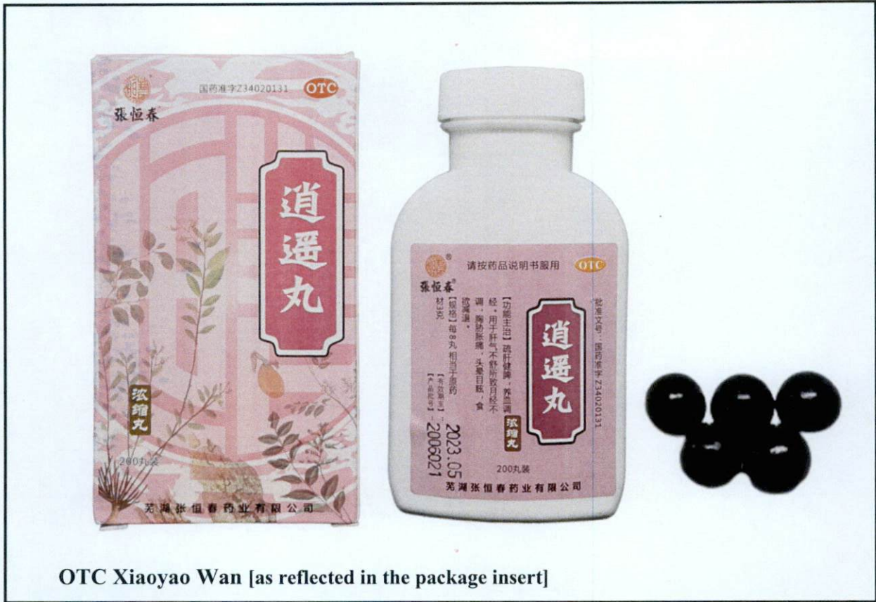
OTC Xiaoyao Wan [as reflected in the package insert]