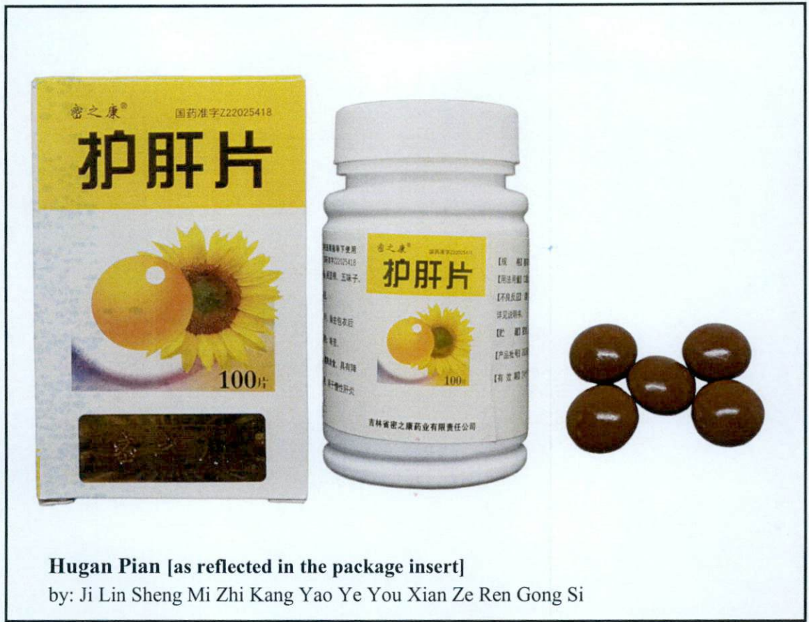
Hugan Pian [as reflected in the package insert] by: Ji Lin Sheng Mi Zhi Kang Yao Ye You Xian Ze Ren Gong Si