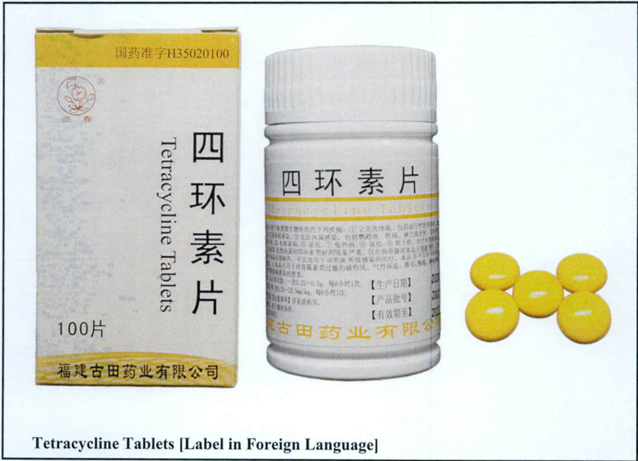
Tetracycline Tablets [Label in Foreign Language]