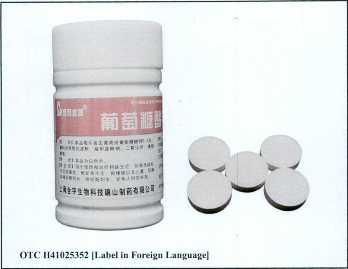
Figure 4. Unregistered drug product