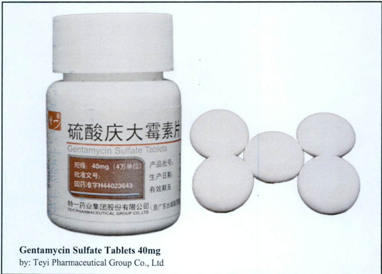
Gentamycin Sulfate Tablets 40mg by: Teyi Pharmaceutical Group Co., Ltd