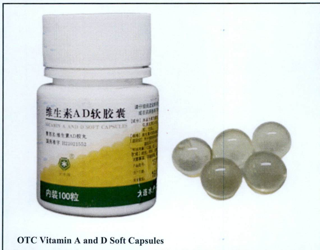
OTC Vitamin A and D Soft Capsules

The Food and Drug Administration (FDA) advises the public against the purchase and use of the following unregistered drug products: