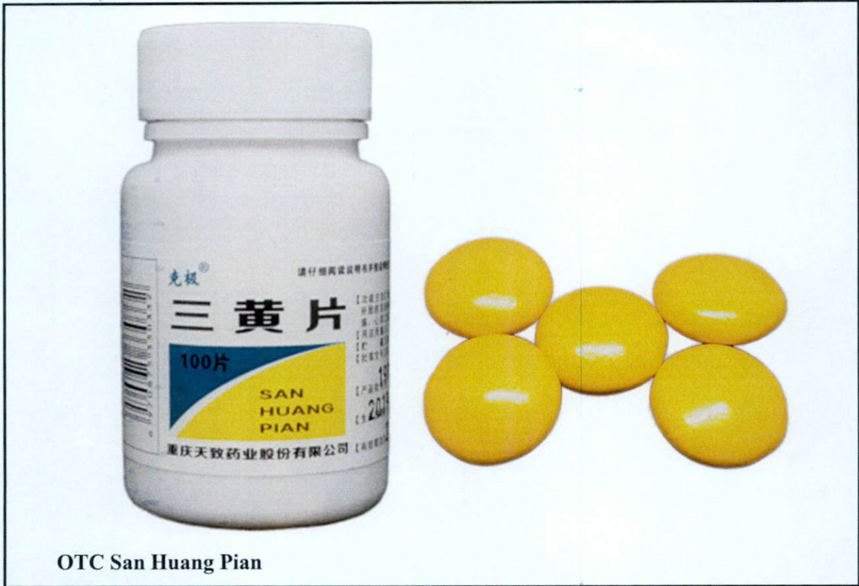
OTC San Huang Pian