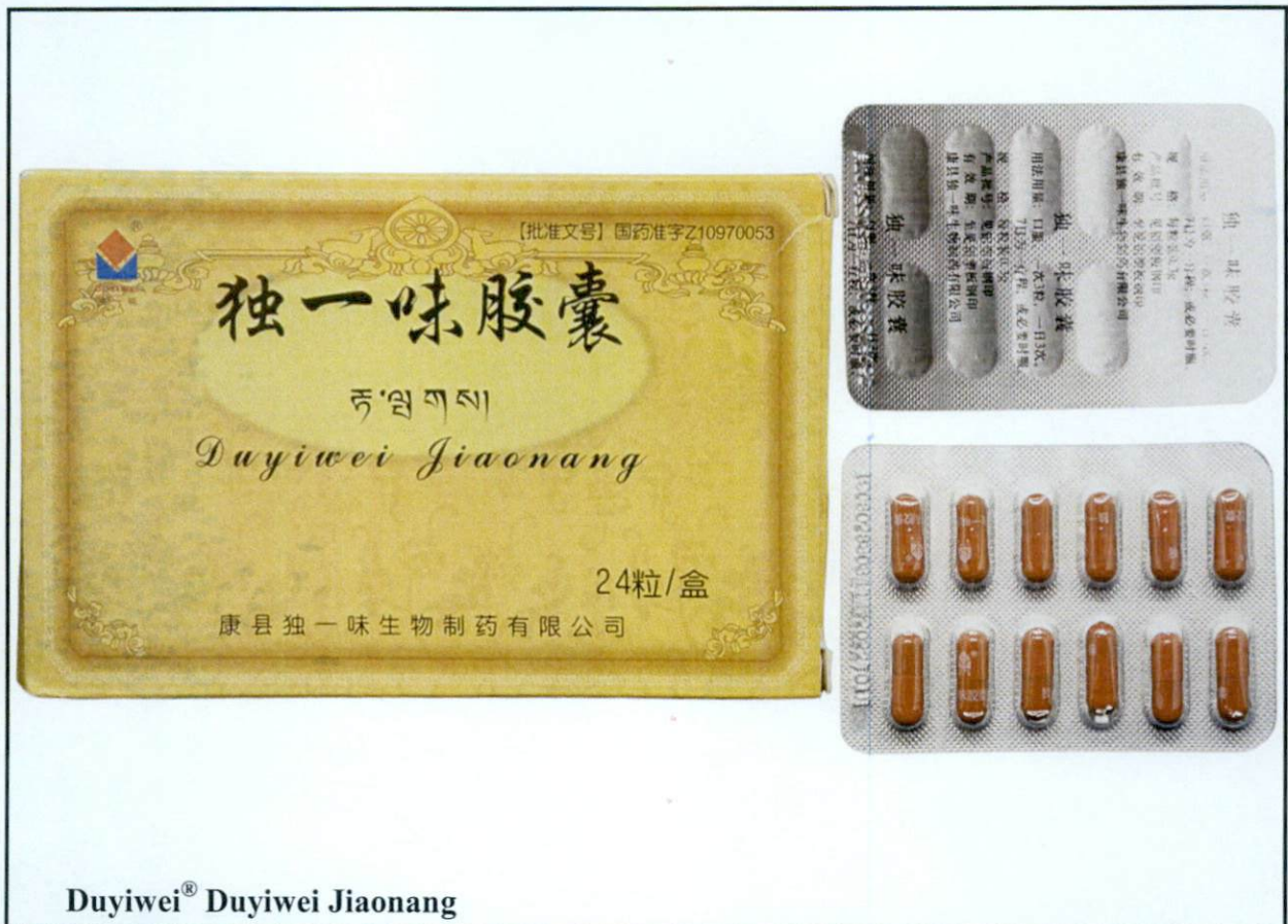
Duyiwei ® Duiyiwei Jiaonang