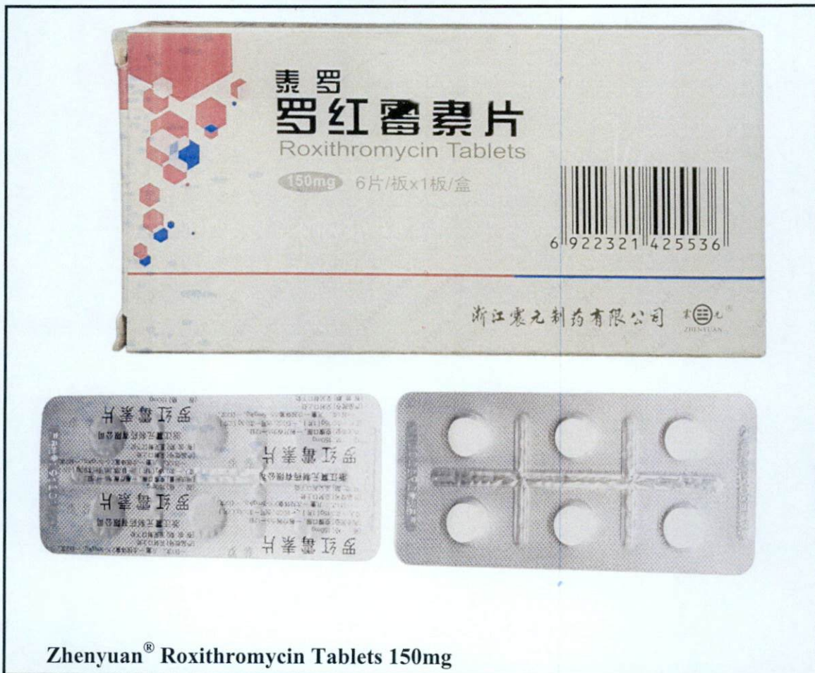
Zhenyuan® Roxithromycin Tablets 150mg

The Food and Drug Administration (FDA) advises the public against the purchase and use of the following unregistered drug products: