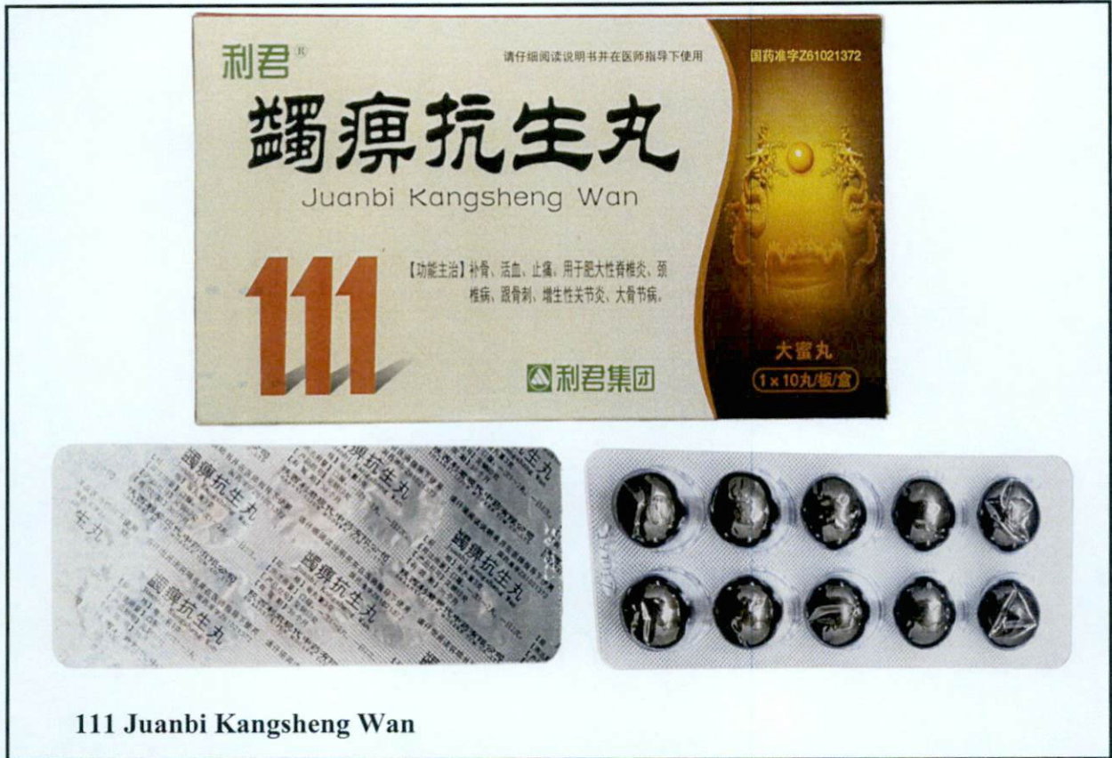
111 Juanbi Kangsheng Wan