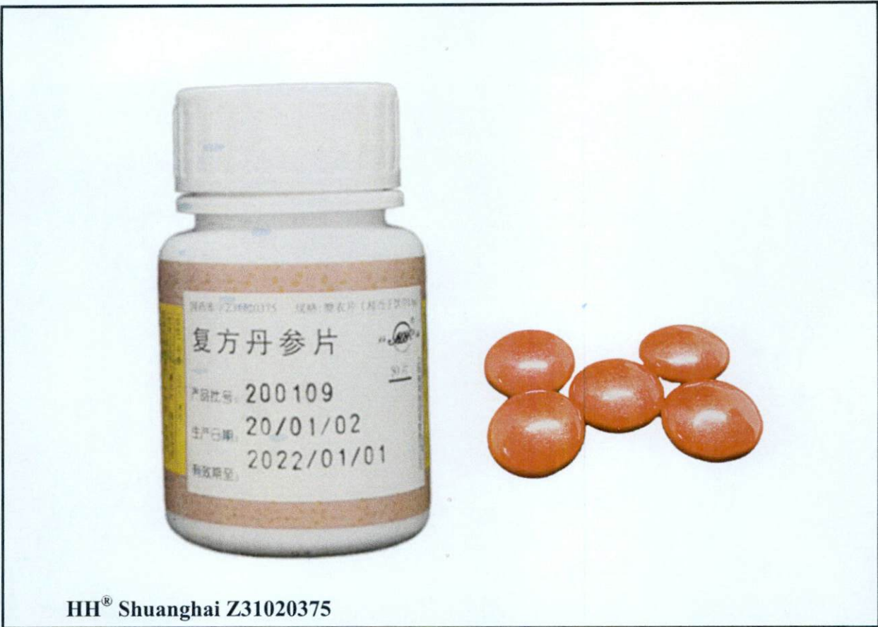
HH® Shuanghai Z31020375