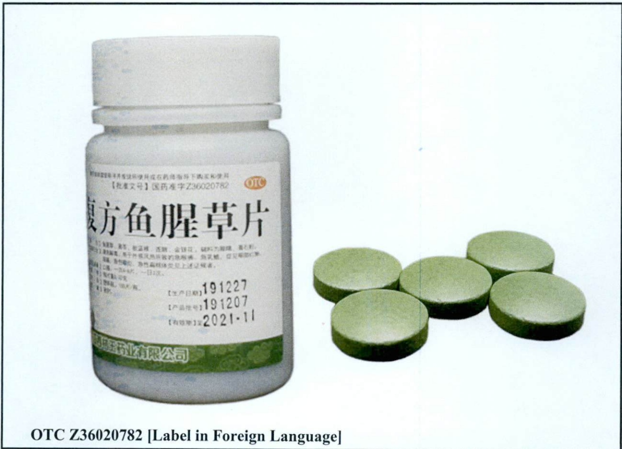
OTC Z36020782 [Label in Foreign Language]