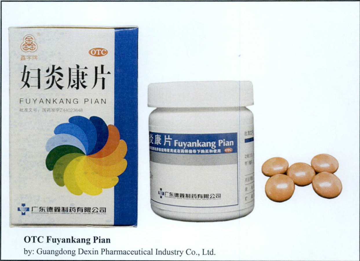
OTC Fuyankang Pian by: Guangdong Dexin Pharmaceutical Industry Co., Ltd.