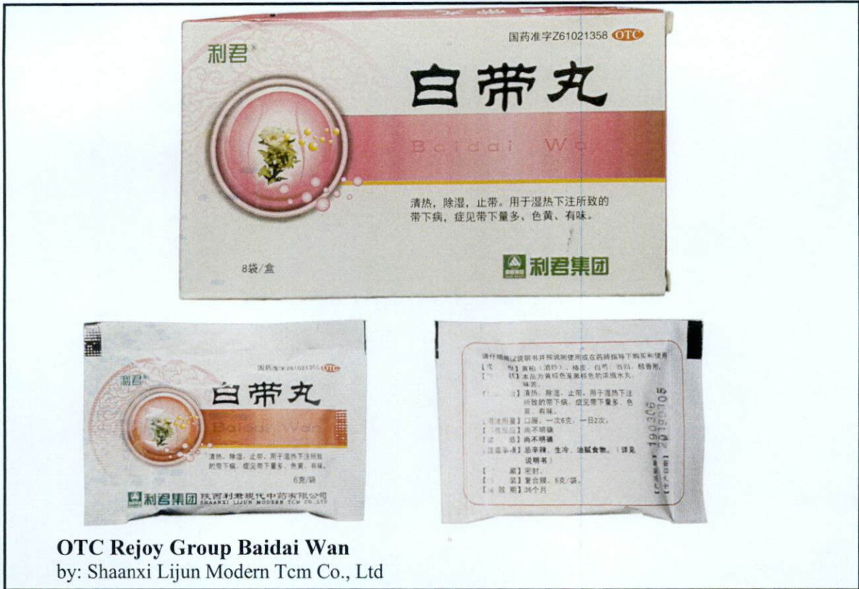
OTC Rejoy Group Baidai Wan by: Shaanxi Lijun Modern Tcm Co., Ltd