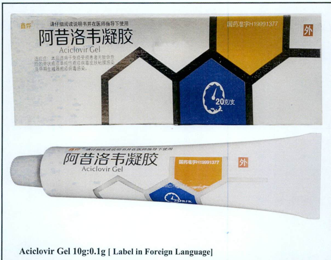
Aciclovir Gel 10g:0.1g [ Label in Foreign Language]

The Food and Drug Administration (FDA) advises the public against the purchase and use of the following unregistered drug products: