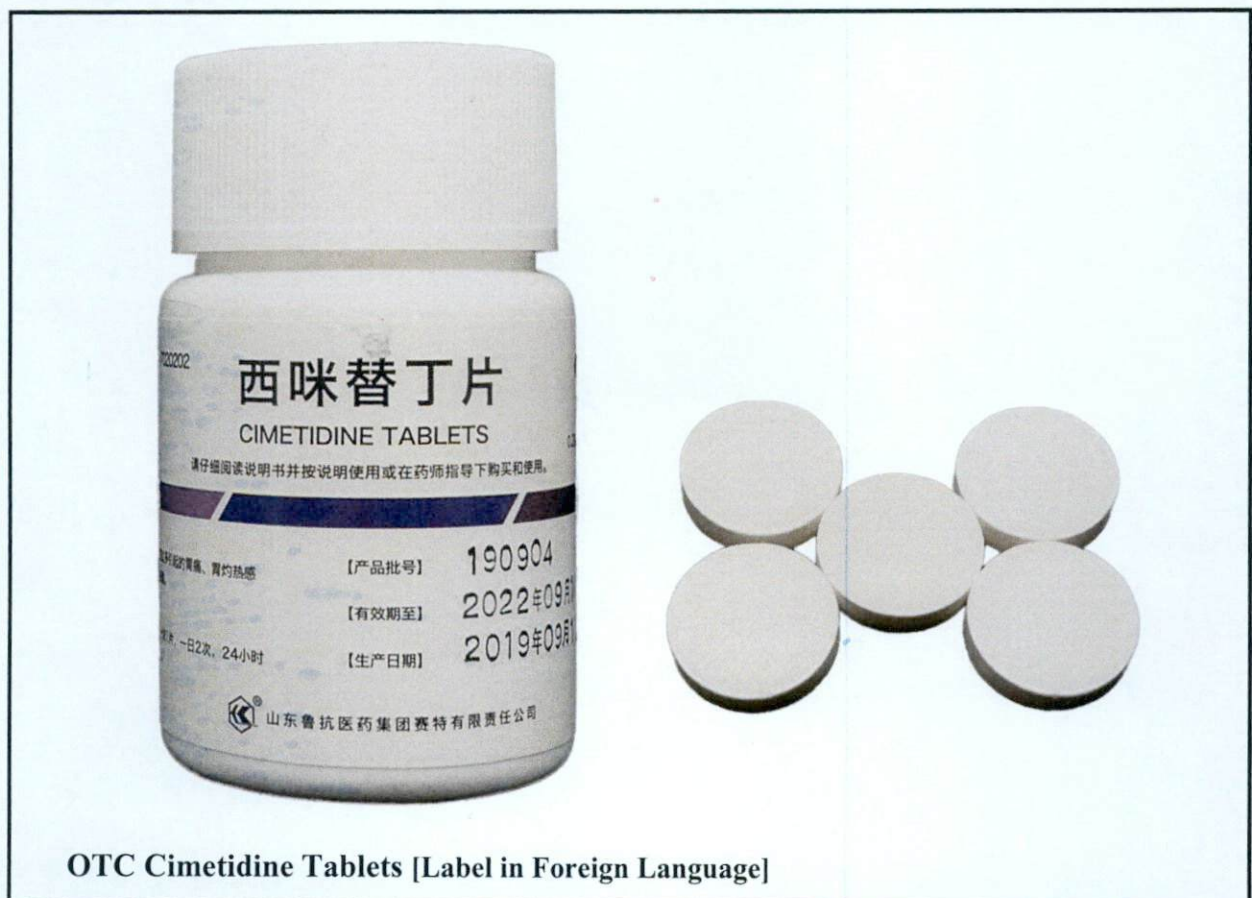
OTC Cimetidine Tablets [Label in Foreign Language]