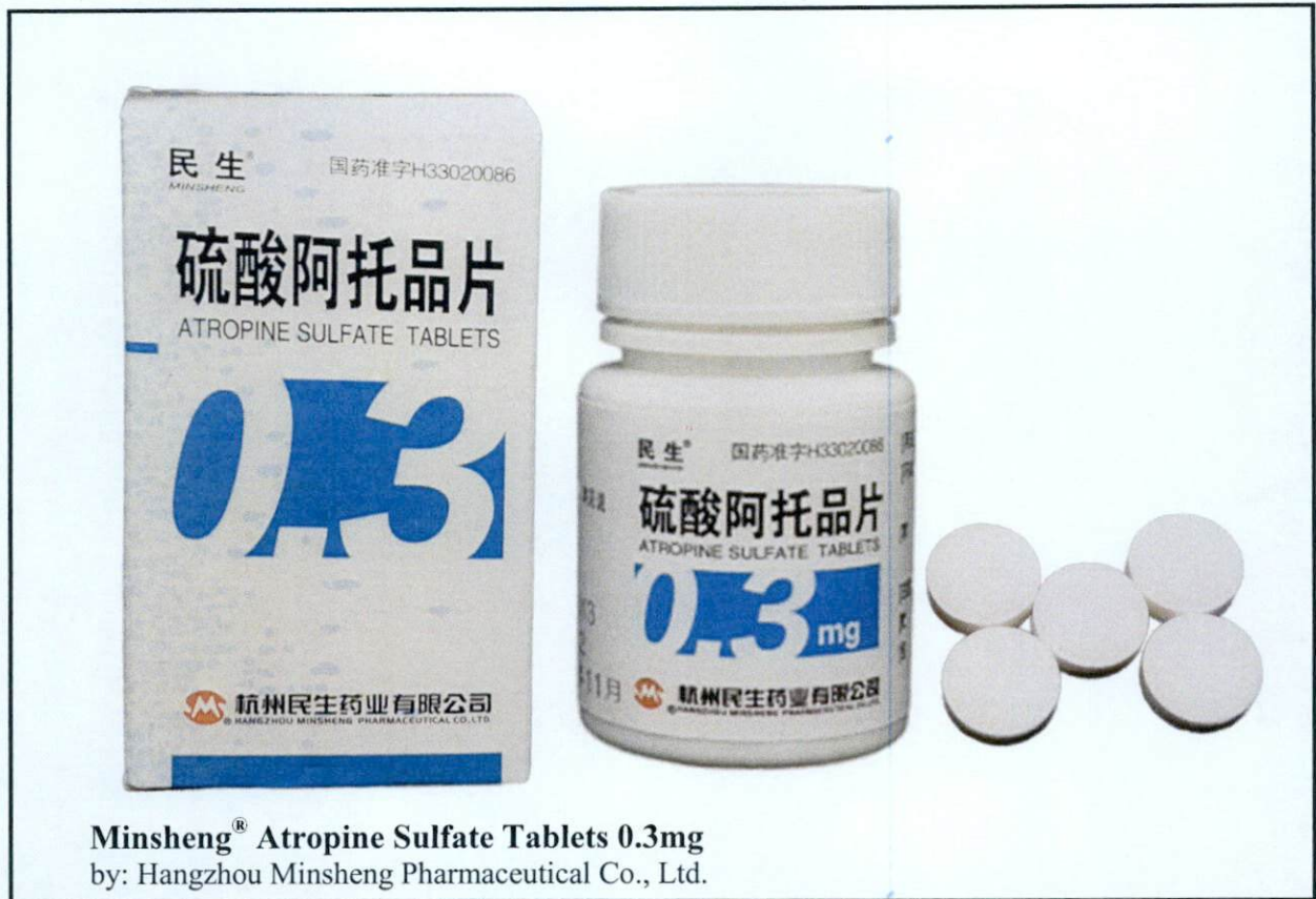
Minsheng® Atropine Sulfate Tablets 0.3mg by: Hangzhou Minsheng Pharmaceutical Co., Ltd.