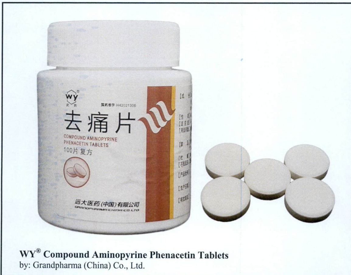
WY ® Compound Aminopyrine Phenacetin Tablets by: Grandpharma (China) Co., Ltd.

The Food and Drug Administration (FDA) advises the public against the purchase and use of the following unregistered drug products: