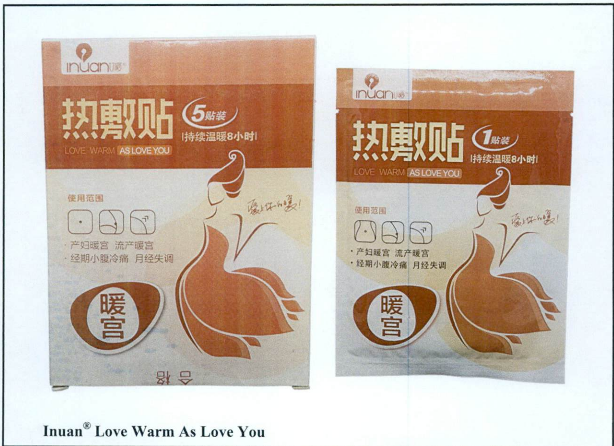
Inuan® Love Warm As Love You