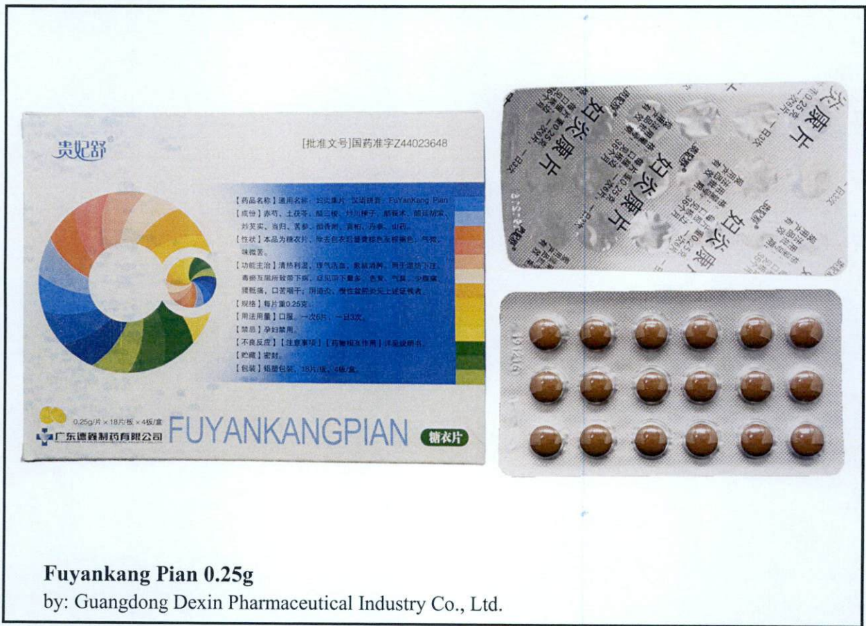
Fuyankang Pian 0.25g by: Guangdong Dexin Pharmaceutical Industry Co., Ltd.