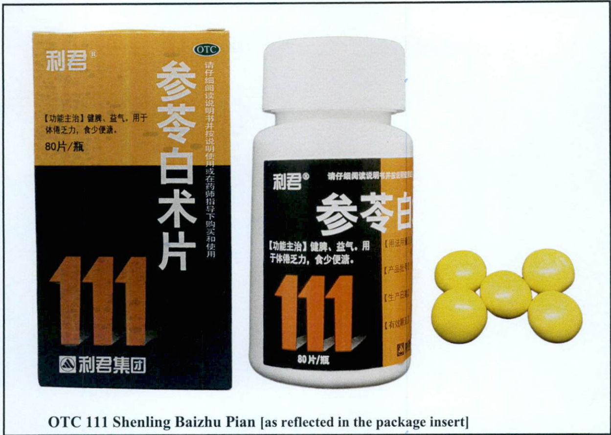
OTC 111 Shenling Baizhu Pian [as reflected in the package insert]