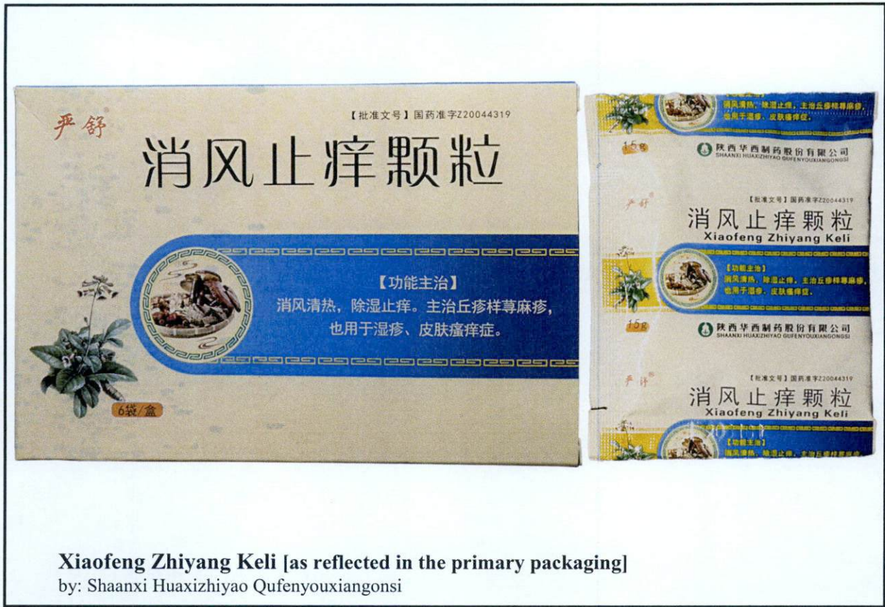
Xiaofeng Zhiyang Keli [as reflected in the primary packaging] by: Shaanxi Huaxizhiyao Qufenyouxiangonsi