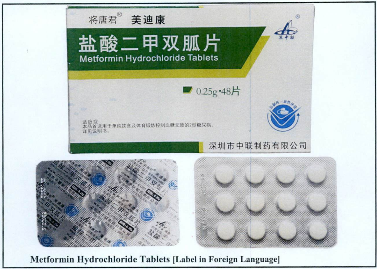
Metformin Hydrochloride Tablets [Label in Foreign Language]