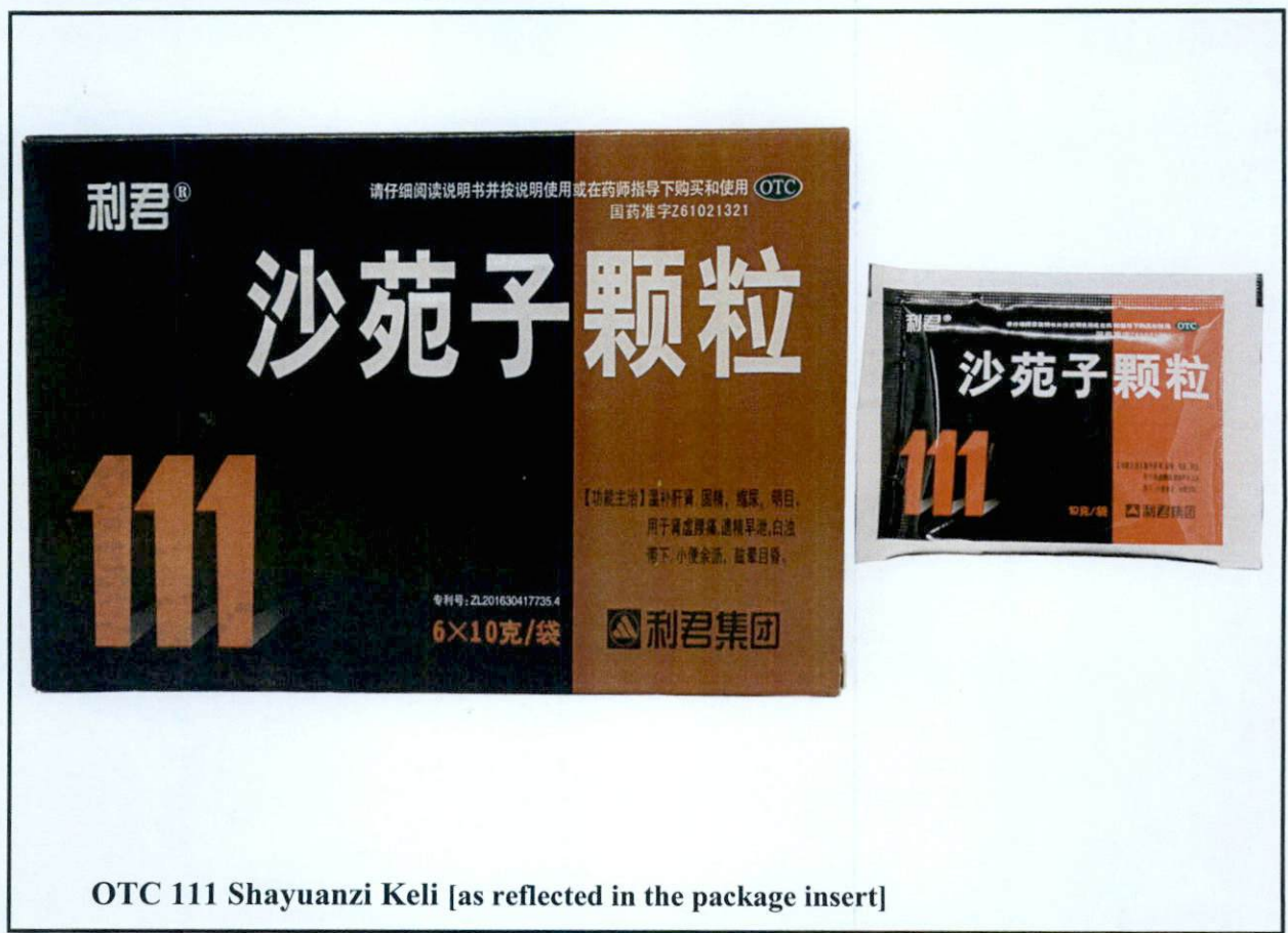
OTC 111 Shayuanzi Keli [as reflected in the package insert]