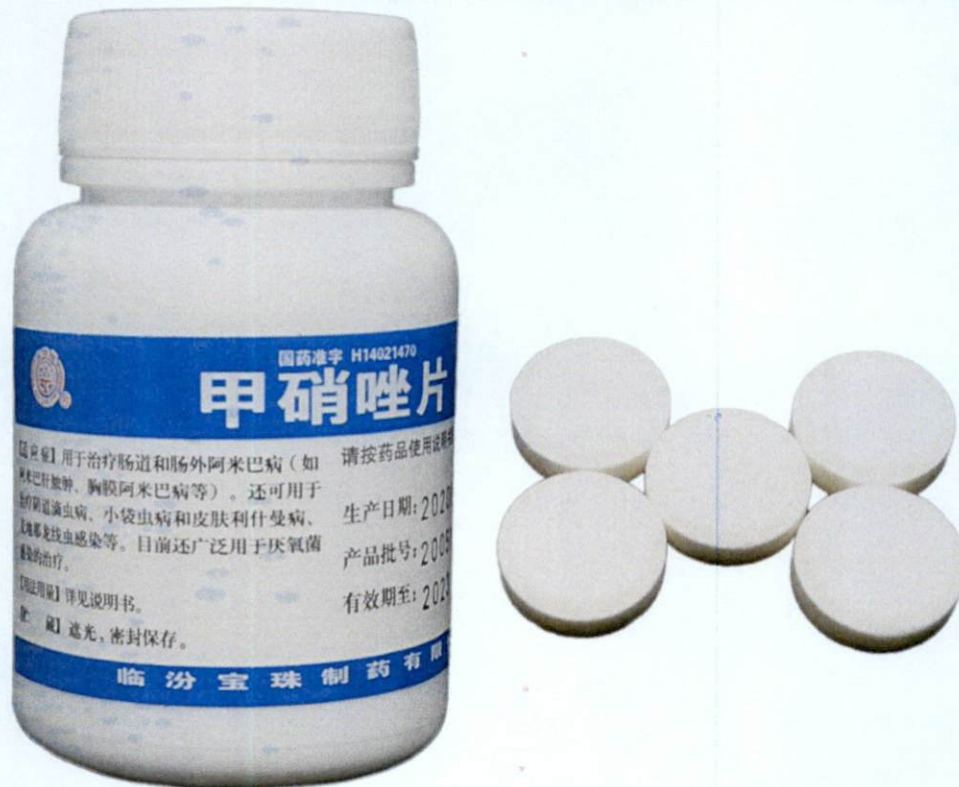
Baozhupai® H14021470 [Label in Foreign Language]