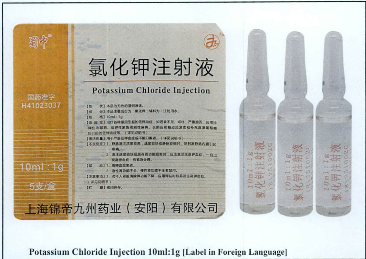
Figure 4. Unregistered drug product

FDA Post-Marketing Surveillance (PMS) activities have verified that the abovementioned drug products have not gone through the registration process of the Agency and have not been issued with proper authorization in the form of Certificate of Product Registration. Thus, the Agency cannot guarantee its quality, safety and efficacy. Therefore, consumption of such violative products may pose potential danger or injury to health.