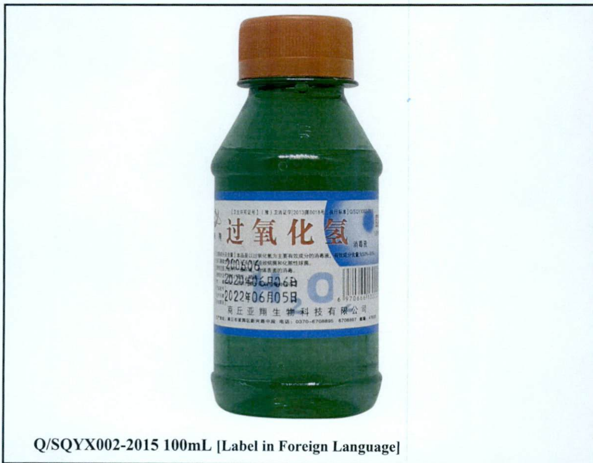
Q/SQYX002-2015 100mL [Label in Foreign Language]

The Food and Drug Administration (FDA) advises the public against the purchase and use of the following unregistered drug products: