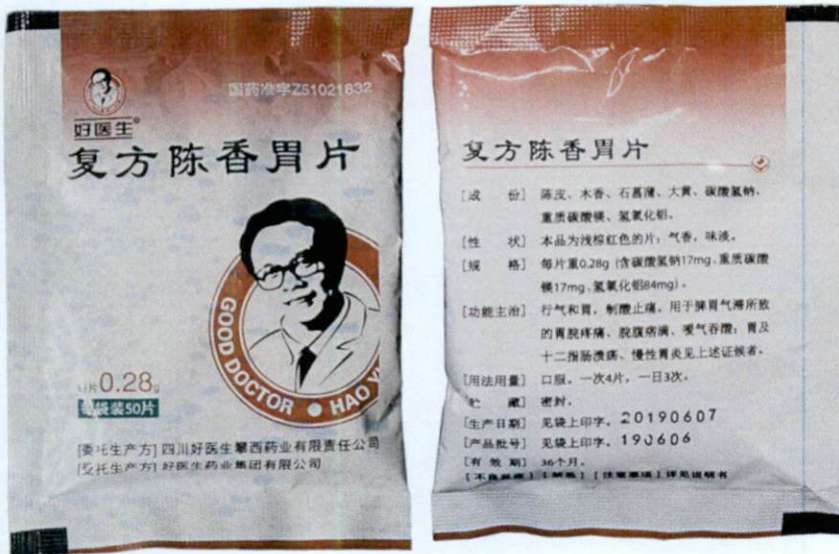
Good Doctor • Hao Yi Sheng 0.28g