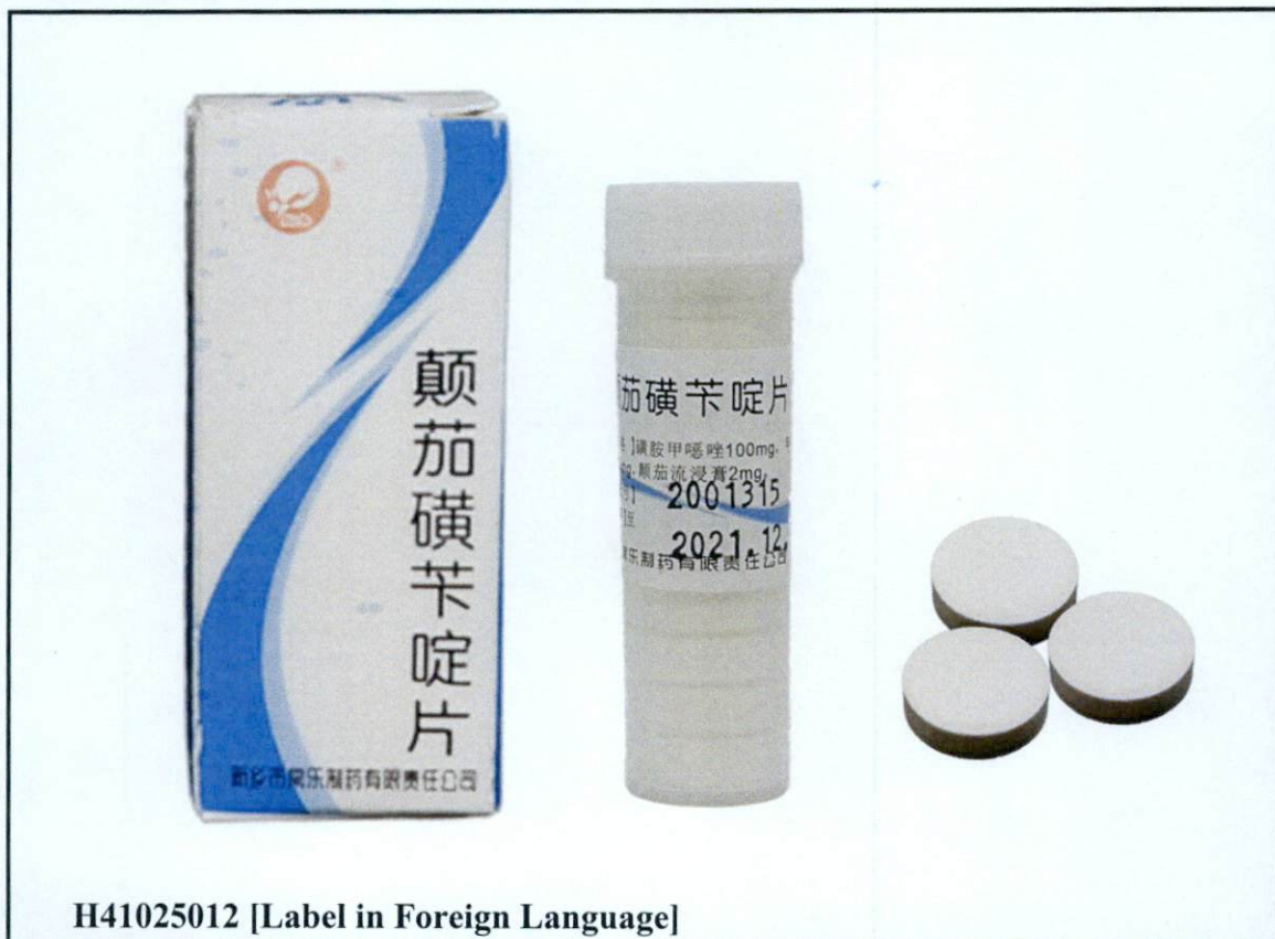
H41025012 [Label in Foreign Language]

The Food and Drug Administration (FDA) advises the public against the purchase and use of the following unregistered drug products: