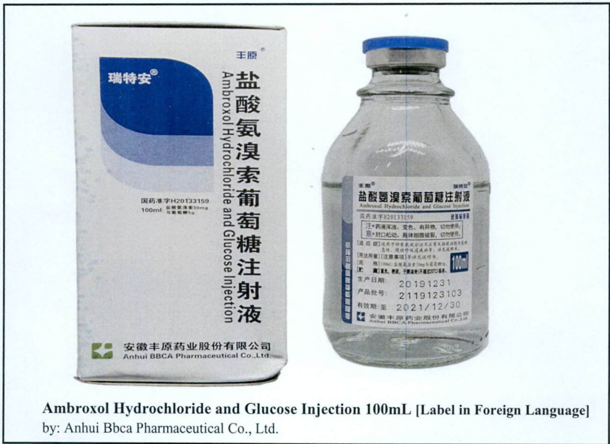
Ambroxol Hydrochloride and Glucose Injection 100mL [Label in Foreign Language] by: Anhui Bbca Pharmaceutical Co., Ltd.