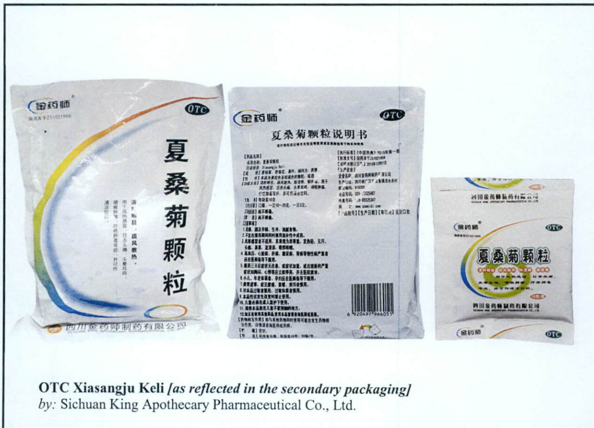
OTC Xiasangju Keli [as reflected in the secondary packaging] by: Sichuan King Apothecary Pharmaceutical Co., Ltd.