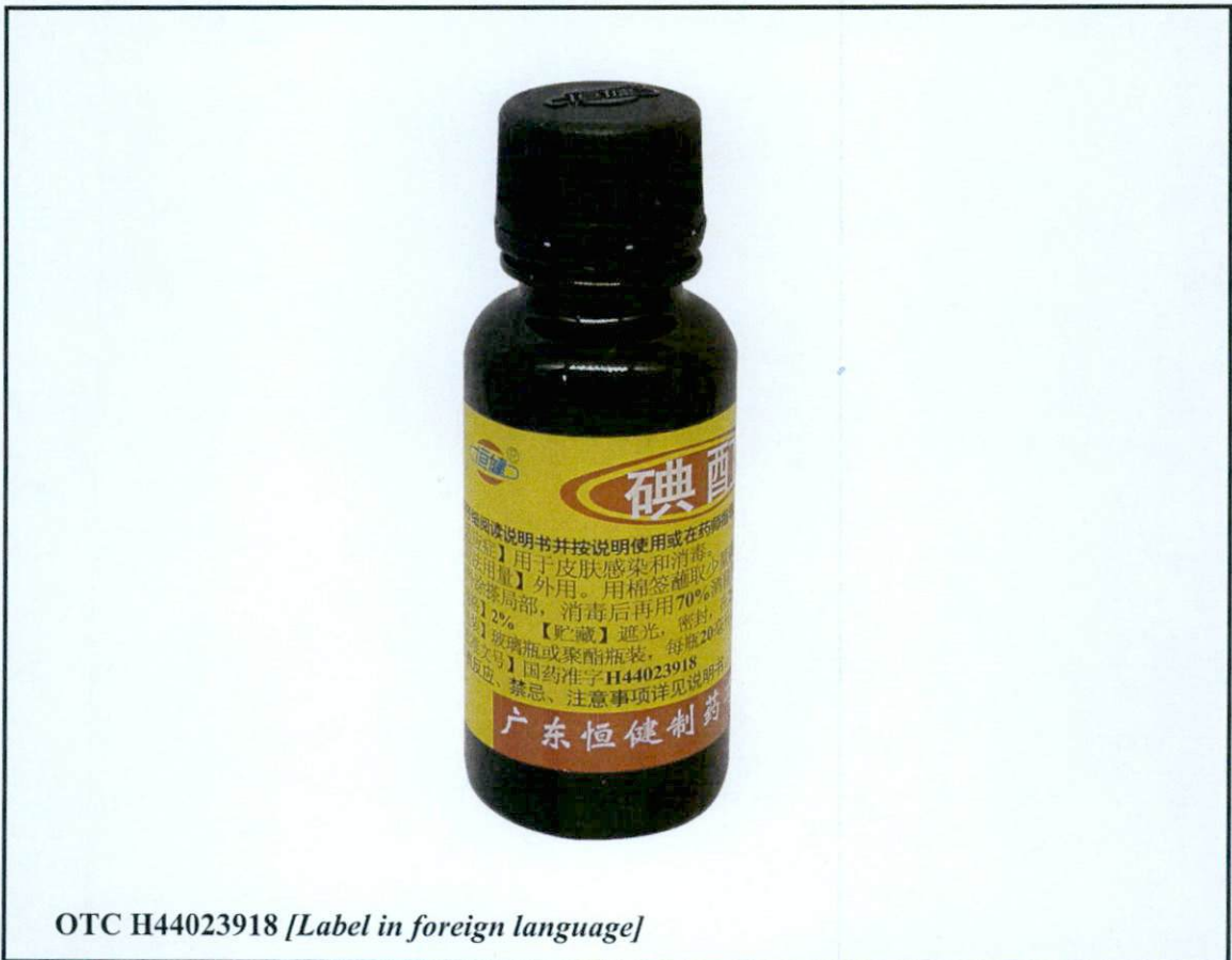
OTC H44023918 [Label in foreign language]