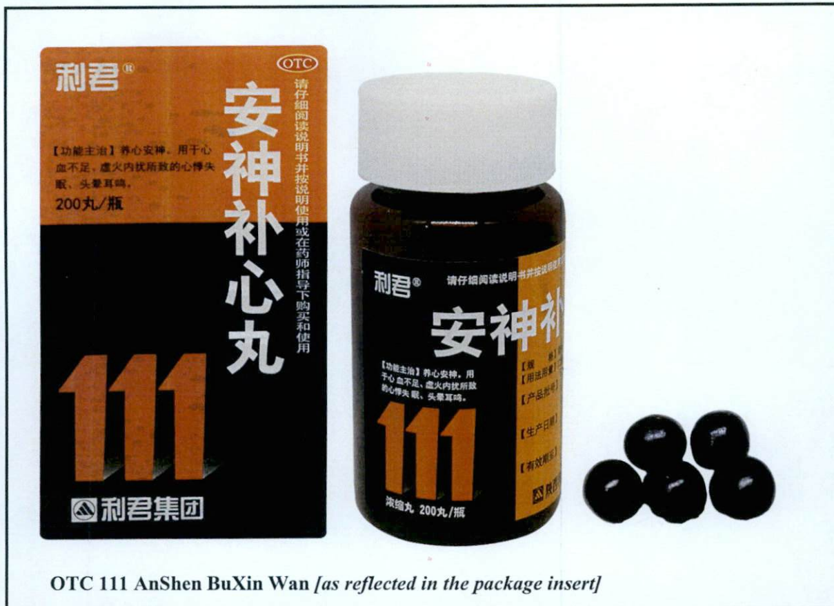
OTC 111 AnShen BuXin Wan [as reflected in the package insert]