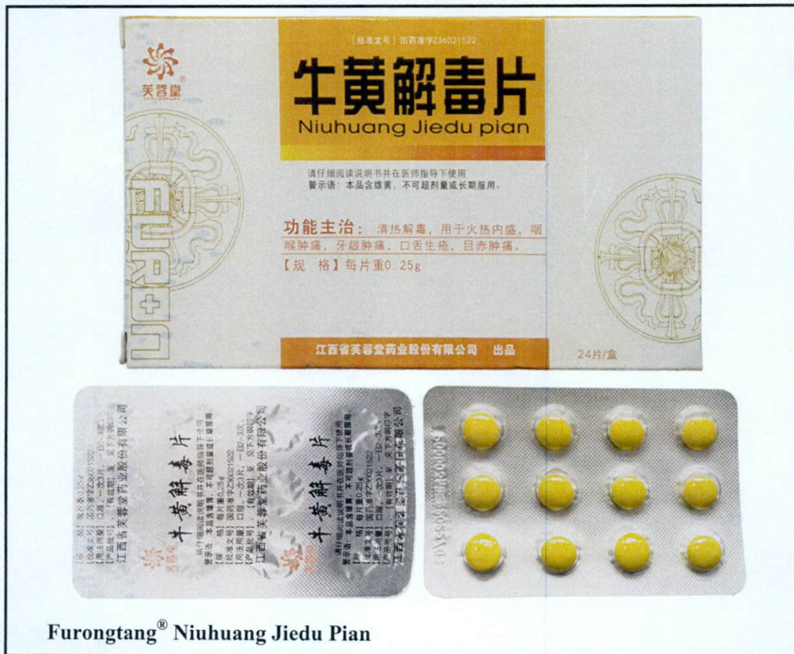
Furongtang® Niuhuang Jiedu Pian

The Food and Drug Administration (FDA) advises the public against the purchase and use of the following unregistered drug products: