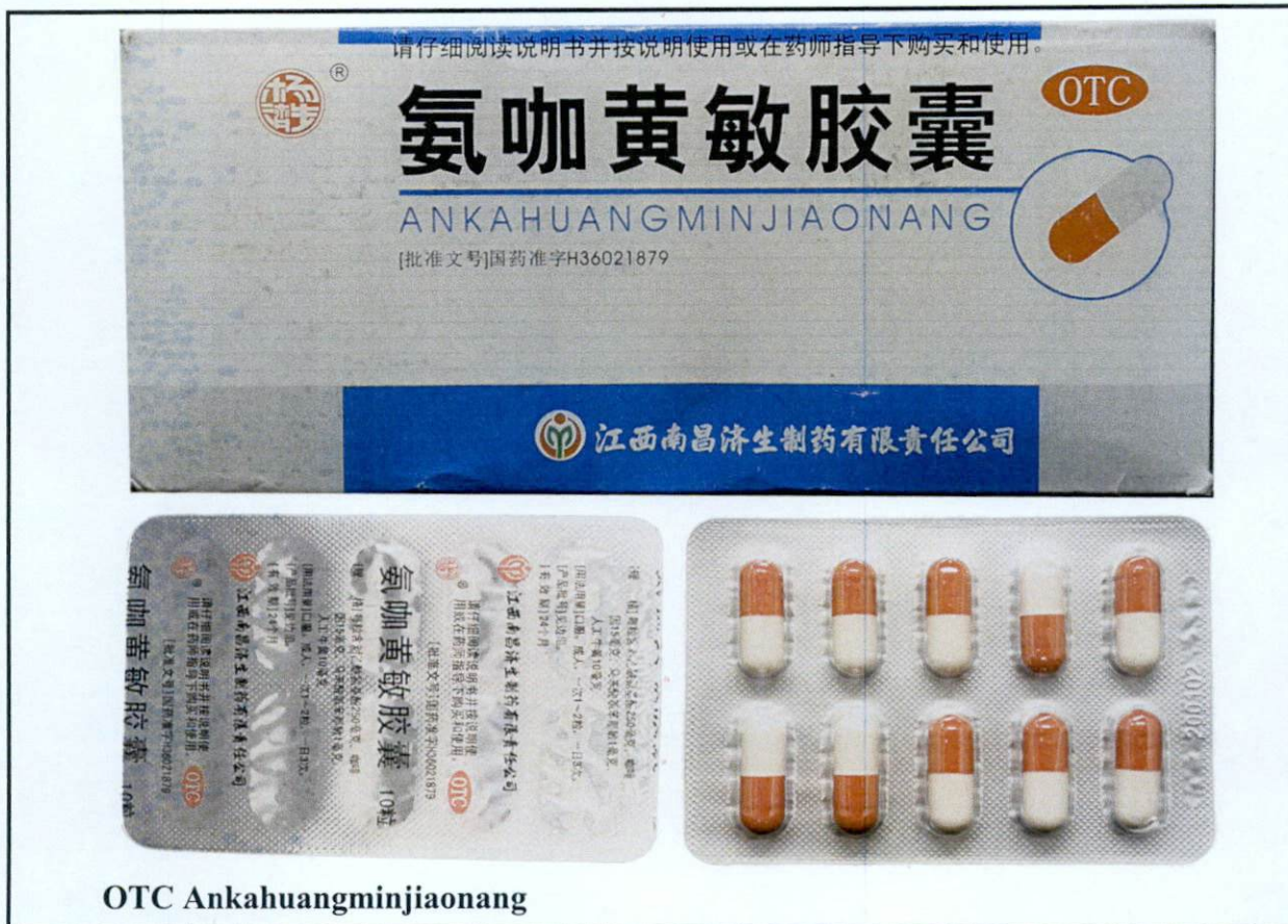
Figure 4. Unregistered drug product