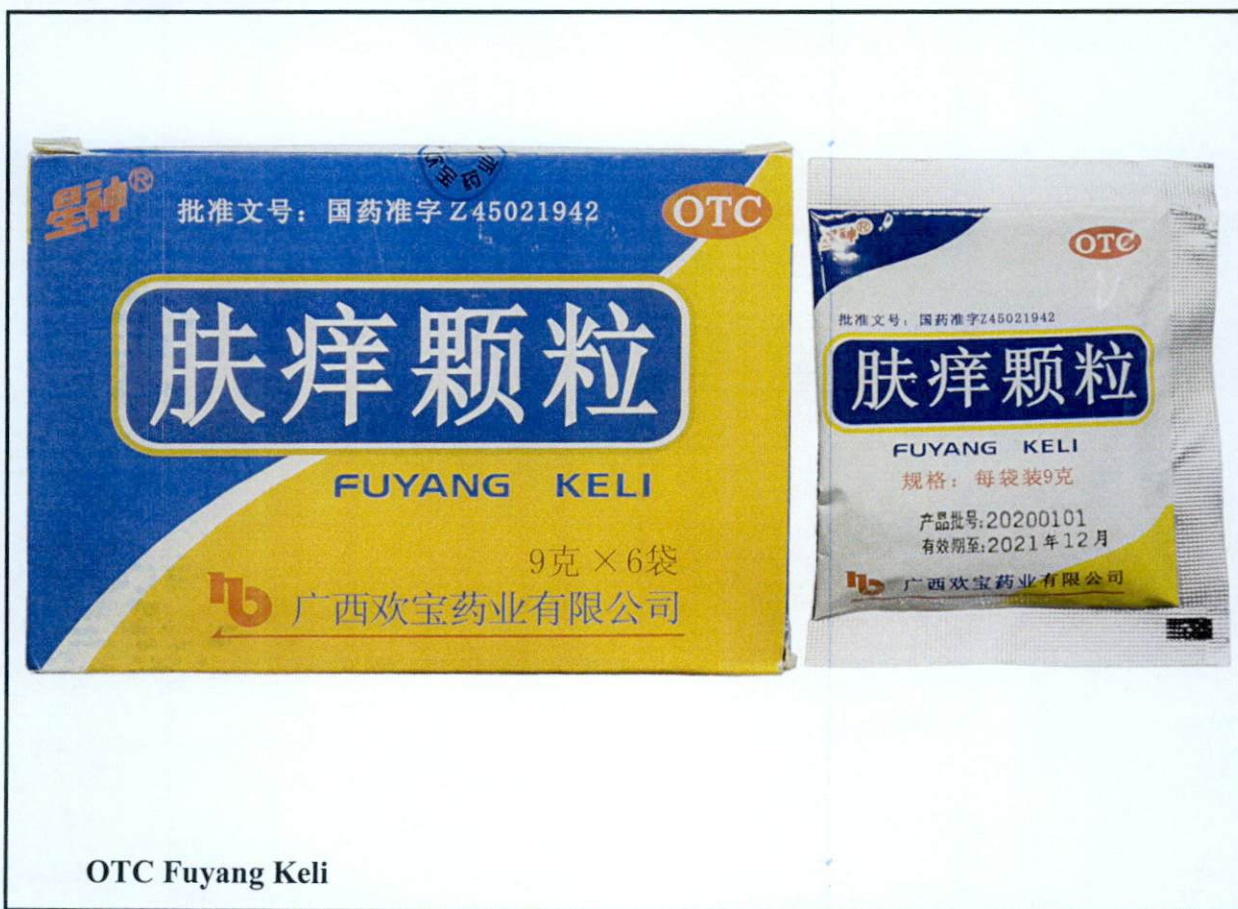
Figure 5. Unregistered drug product