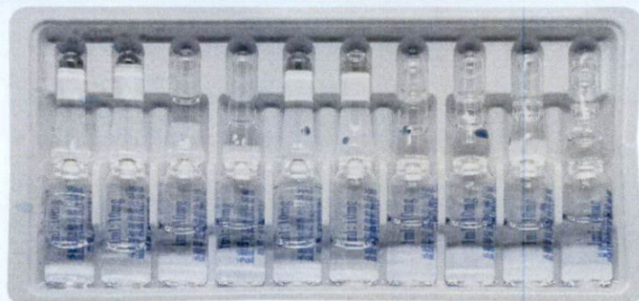
Yansuan Jiayang Lupu'an Zhusheye 1ml:10mg