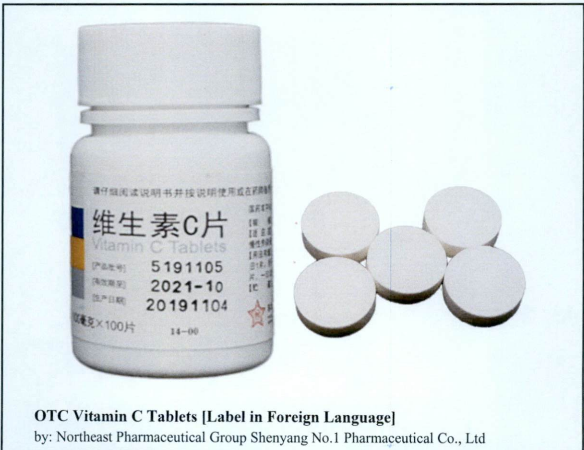
OTC Vitamin C Tablets [Label in Foreign Language]