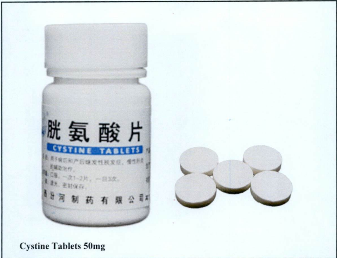
Cystine Tablets 50mg