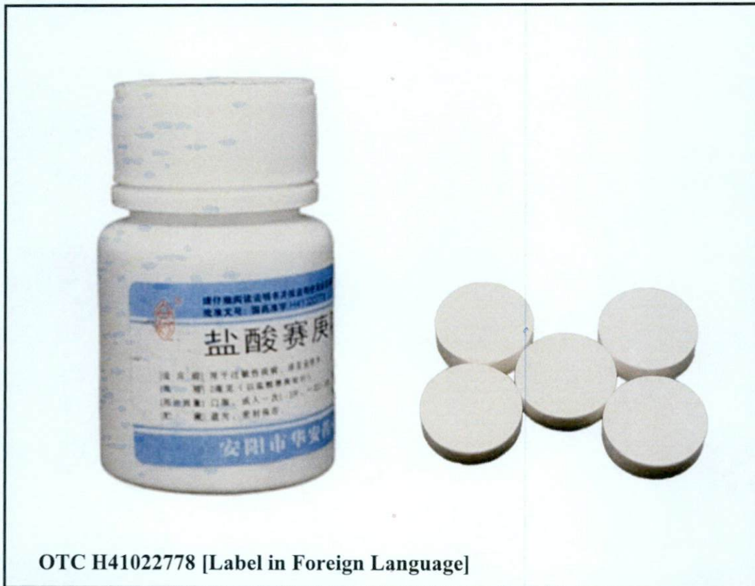
OTC H41022778 [Label in Foreign Language]

The Food and Drug Administration (FDA) advises the public against the purchase and use of the following unregistered drug products: