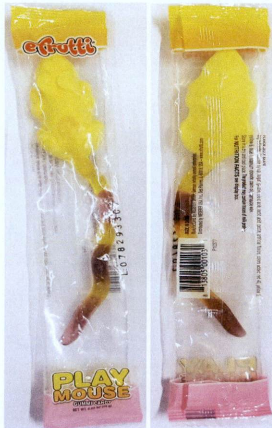
Figure 1. Unregistered EFRUTTI Play Mouse Gummi Candy, 15g

The Food and Drug Administration (FDA) warns all healthcare professionals and the general public NOT TO PURCHASE AND CONSUME the following unregistered food products: