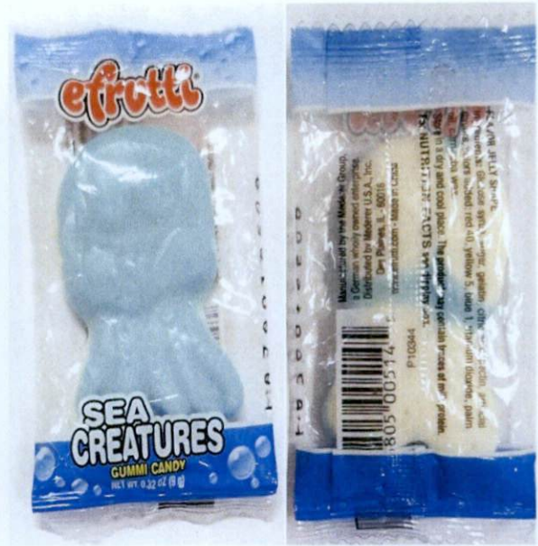
Figure 3. Unregistered EFRUTTI Sea Creatures Gummi Candy