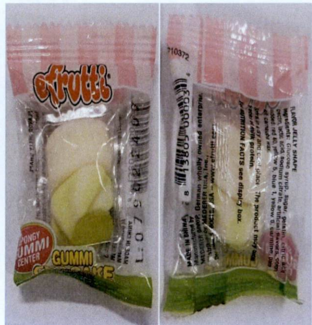
Figure 5. Unregistered EFRUTTI Gummi Cup Cake Gummi Candy