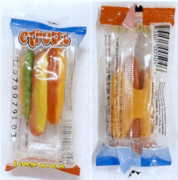
Figure 2. Unregistered EFRUTTI Hotdog Gummi Candy