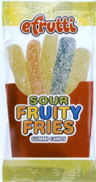
Figure 4. Unregistered EFRUTTI Sour Fruity Fries Gummi Candy