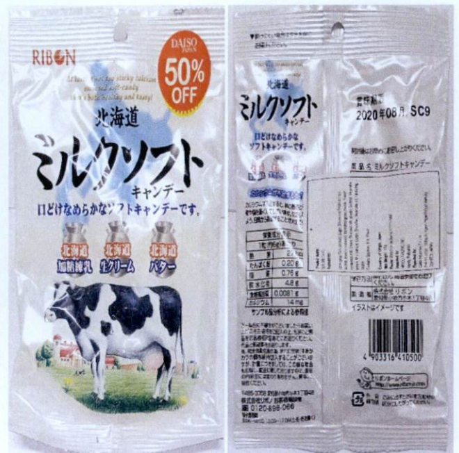
Figure 5. Unregistered RIBON Soft Milk Candy