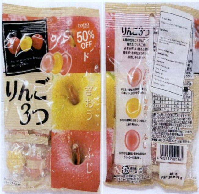
Figure 4. Unregistered (UNBRANDED) Three Kinds of Assortment Apple Candies