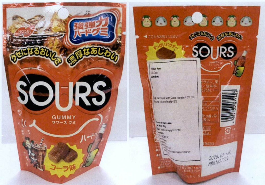
Figure 1. Unregistered NOBEL Sours Gummy Cola Candy

The Food and Drug Administration (FDA) warns all healthcare professionals and the general public NOT TO PURCHASE AND CONSUME the following unregistered food products: