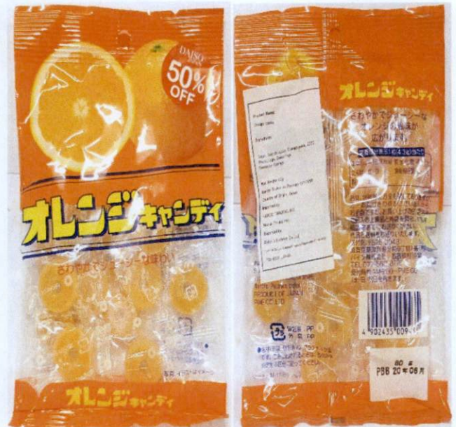
Figure 3. Unregistered (UNBRANDED) Orange Candy