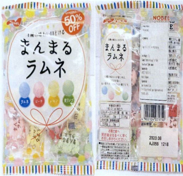
Figure 2. Unregistered NOBEL Mammaru Ramune Candy