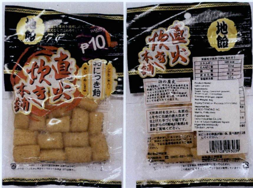
Figure 1. Unregistered (UNBRANDED) Spicy Candies (Labels are in foreign characters)

The Food and Drug Administration (FDA) warns all healthcare professionals and the general public NOT TO PURCHASE AND CONSUME the following unregistered food products: