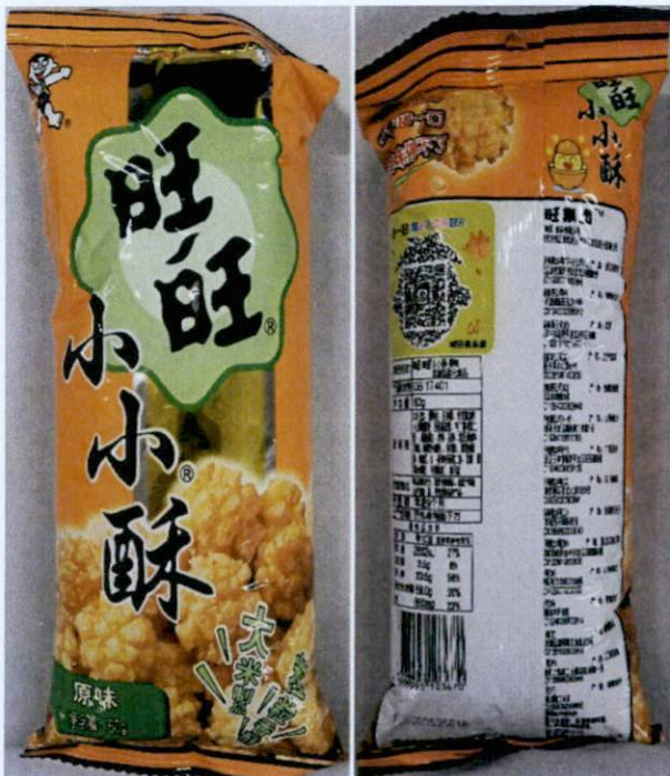
Figure 3. Unregistered (UNRBANDED) Orange, and Green Packaging, 60g (Labels are in foreign characters-BARCODE: 6909995103670)