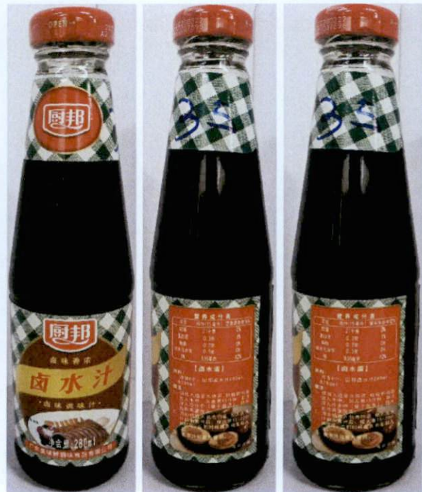
Figure 4. Unregistered (UNRBANDED) Dark Brown Sauce in Red and Green Packaging, Glass Bottle 280ml (Labels are in foreign characters-BARCODE: 6902902003476)