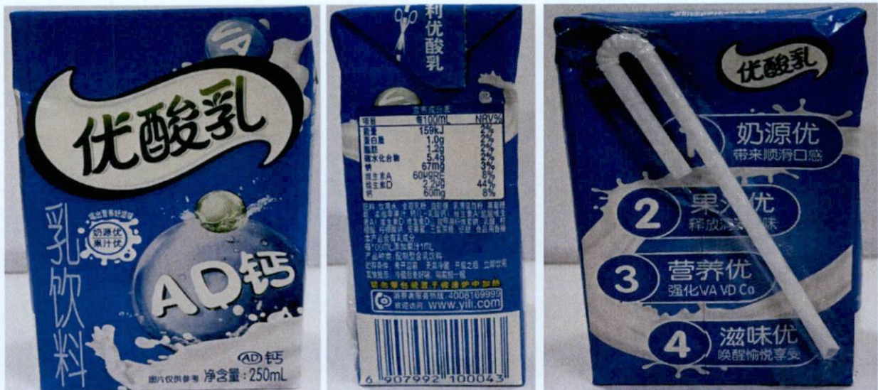
Figure 2. Unregistered AD Tetra Pack Drink, 250ml (in Blue, Green and white Colored Label with Foreign Text- BARCODE: 69079921000043)