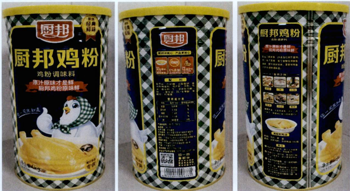
Figure 5. Unregistered (UNBRANDED) Food in Aluminum Can in Blue, White and Green Packaging and Chicken Artwork, 1kg (Labels are in foreign characters-BARCODE: 6902902006781)

The FDA verified through post-marketing surveillance that the abovementioned food products are not registered and no corresponding Certificates of Product Registration (CPR) have been issued. Pursuant to the Republic Act No. 9711, otherwise known as the “Food and Drug Administration Act of 2009”, the manufacture, importation, exportation, sale, offering for sale, distribution, transfer, non-consumer use, promotion, advertising or sponsorship of health products without the proper authorization is prohibited.