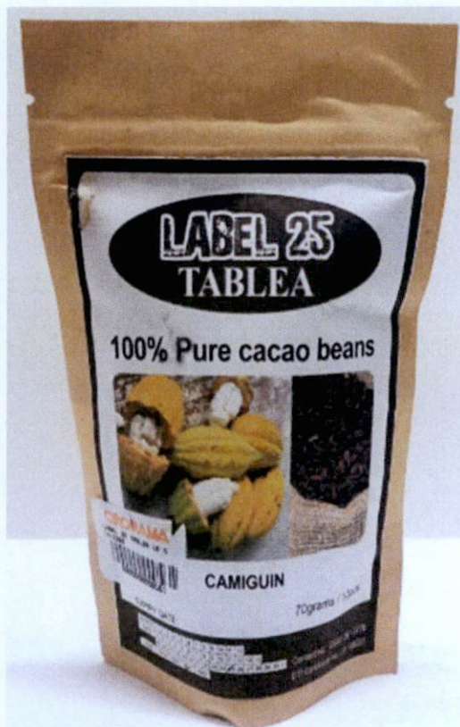
Figure 4. Unregistered LABEL 25 TABLEA 100% Pure Cacao Beans, 70grams/10pcs