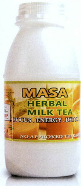
Figure 3. Unregistered MASA Herbal Milk Tea