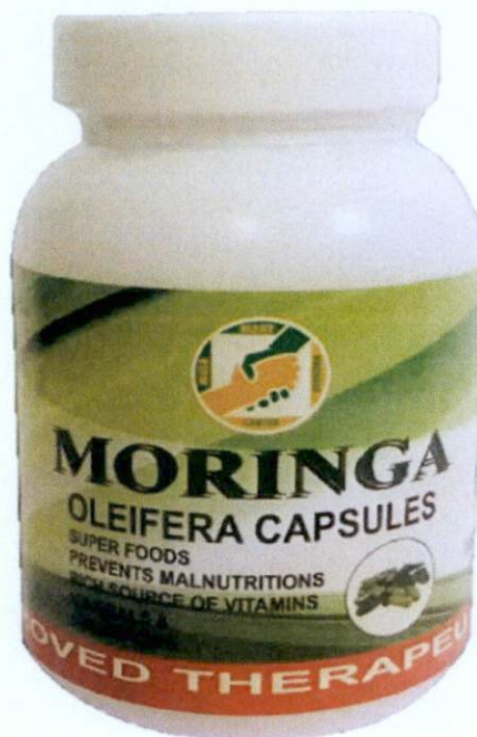
Figure 1. Unregistered MASA Moringa Oleifera Capsule

The Food and Drug Administration (FDA) warns all healthcare professionals and the general public NOT TO PURCHASE AND CONSUME the following unregistered food supplements and food products: