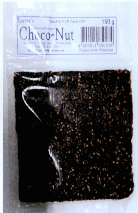
Figure 5. Unregistered LORETA'S DELICIOUS AND NUTRITIOUS Choco-Nut, 150g