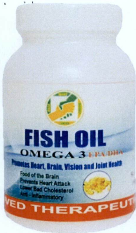
Figure 2. Unregistered MASA Fish Oil Omega 3 EPA/DHA