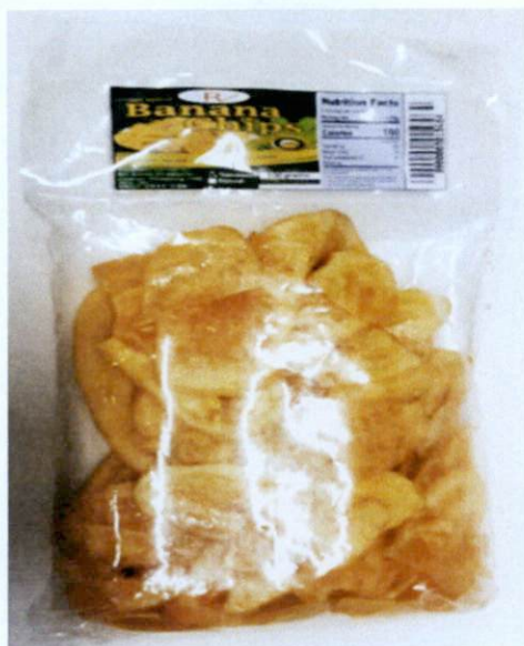
Figure 2. Unregistered RV Home Made Banana Chips – Sweetened, Net Wt. 100g