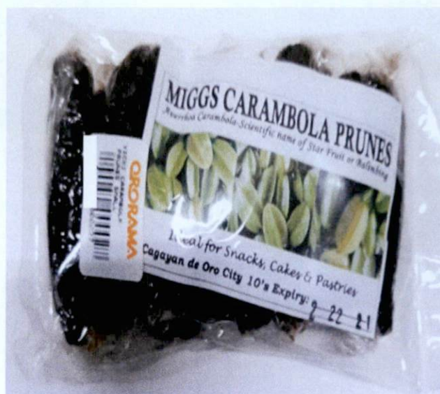
Figure 5. Unregistered MIGGS CARAMBOLA PRUNES Vicki Carambola Prunes - Small