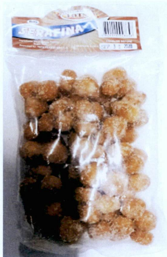
Figure 1. Unregistered TOTS Serafina – Big

The Food and Drug Administration (FDA) warns all healthcare professionals and the general public NOT TO PURCHASE AND CONSUME the following unregistered food products: