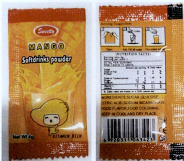
Figure 3. Unregistered SWEETTY Mango Softdrinks Powder, Net Wt. 4g