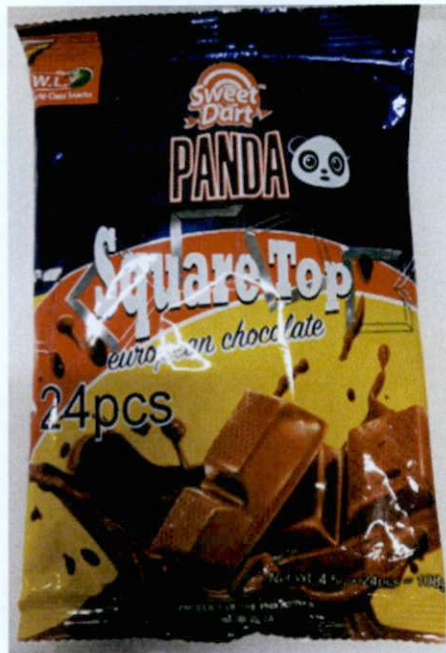
Figure 2. Unregistered W.L. SWEET DART Panda Square Top European Chocolate, Net Wt. 4.5g X 24pcs=108g