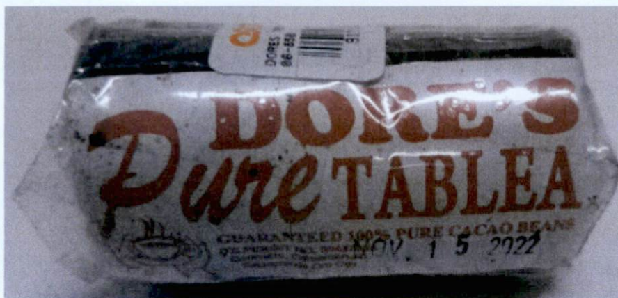
Figure 4. Unregistered DORE'S Pure Tablea, 12's