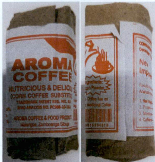
Figure 3. Unregistered AROMA COFFEE Nutricious & Delicious (Corn Coffee Substitute)