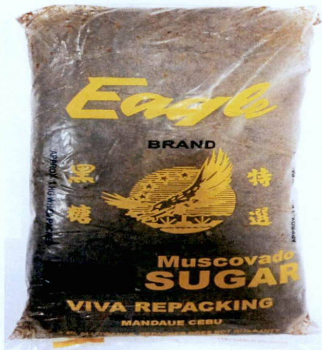
Figure 4. Unregistered EAGLE BRAND Muscovado Sugar, 1kg