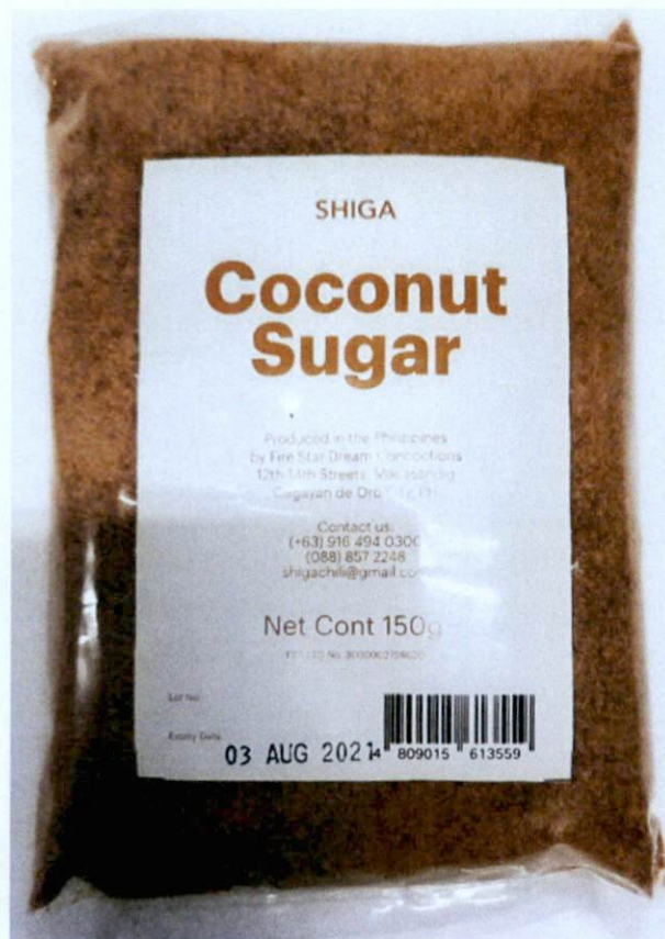
Figure 1. Unregistered SHIGA Coconut Sugar, Net Cont. 150g

The Food and Drug Administration (FDA) warns all healthcare professionals and the general public NOT TO PURCHASE AND CONSUME the following unregistered food products: