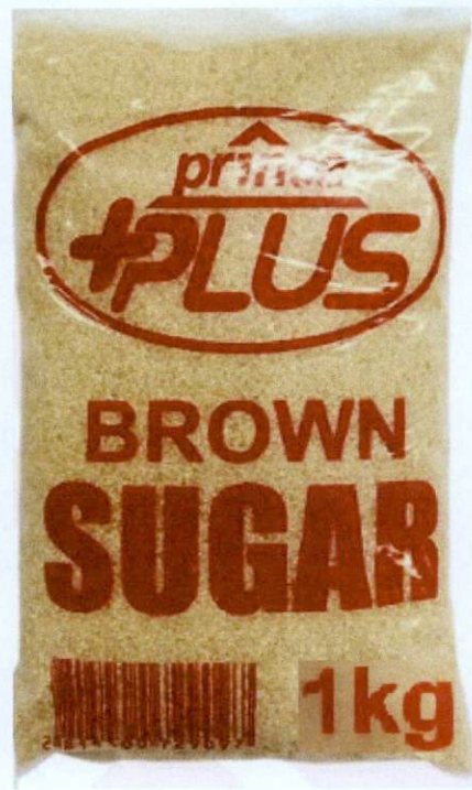
Figure 3. Unregistered PRINCE PLUS Brown Sugar, 1kg