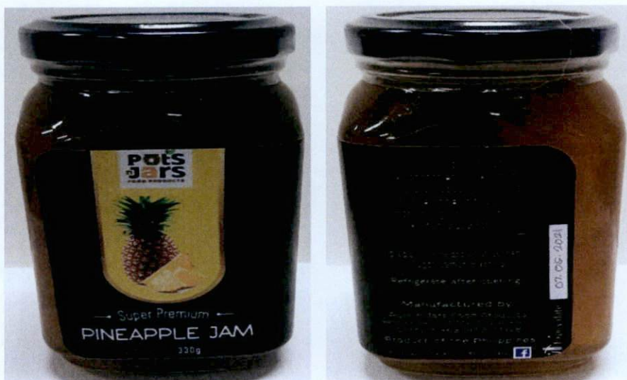
Figure 3. Unregistered POTS N JARS Food Products Super Premium Pineapple Jam, Net Wt. 330g