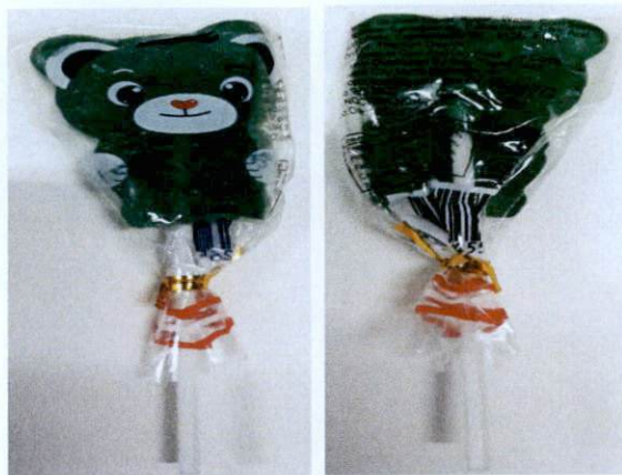
Figure 2. Unregistered (UNBRANDED) Gummybear Lollipop – Green, Net Wt. 17g