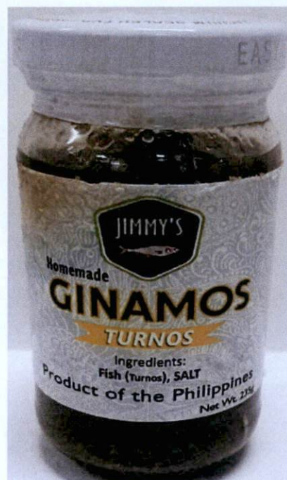
Figure 5. Unregistered JIMMY'S HOMEMADE Ginamos Turnos, Net Wt. 235g