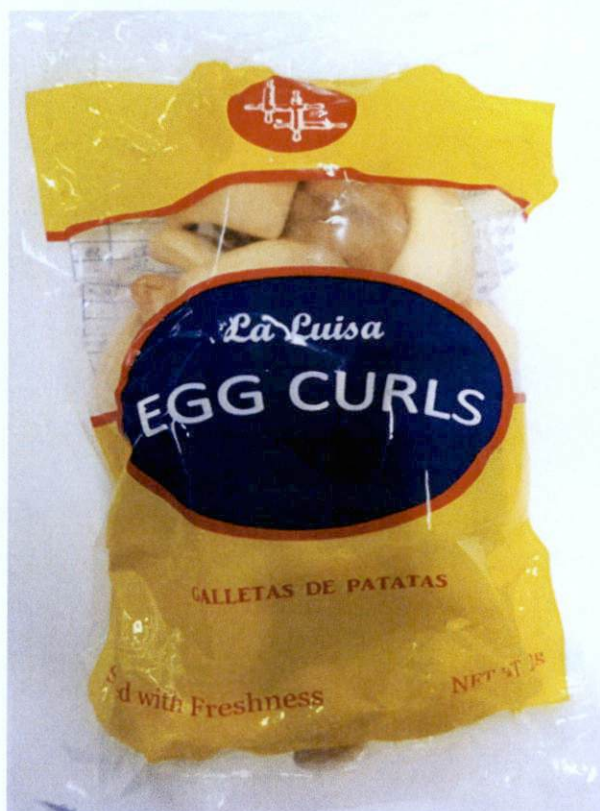
Figure 1. Unregistered LA LUISA Egg Curls – Galletas de Patatas, Net Wt. 150g

The Food and Drug Administration (FDA) warns all healthcare professionals and the general public NOT TO PURCHASE AND CONSUME the following unregistered food products: