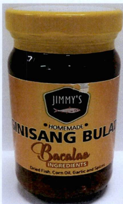
Figure 4. Unregistered JIMMY'S HOMEMADE Ginisang Bulad - Bacalao, Net Wt. 235g