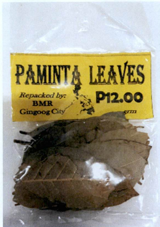
Figure 3. Unregistered (UNBRANDED Paminta Leaves