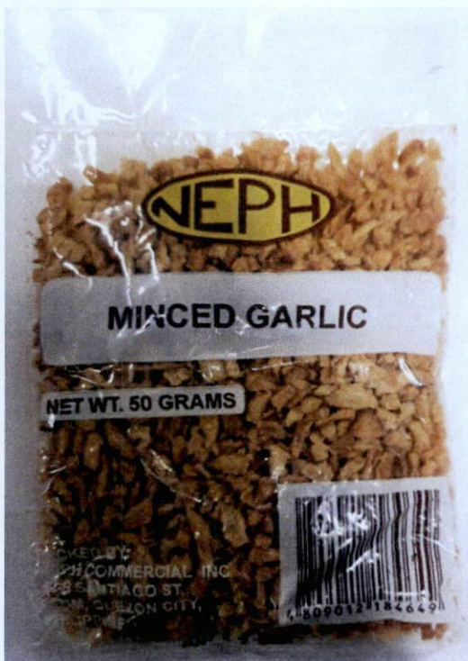
Figure 4. Unregistered NEPH Minced Garlic, Net Wt. 50 Grams