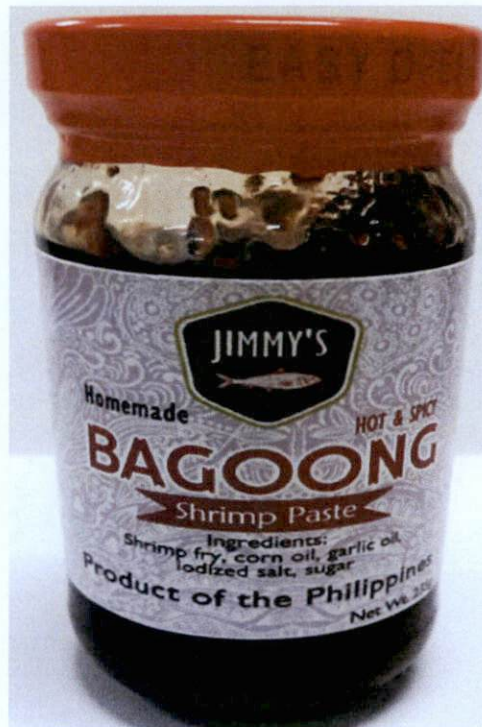
Figure 1. Unregistered JIMMY'S HOMEMADE Bagoong - Shrimp Paste Hot & Spicy, Net Wt. 235g

The Food and Drug Administration (FDA) warns all healthcare professionals and the general public NOT TO PURCHASE AND CONSUME the following unregistered food products: