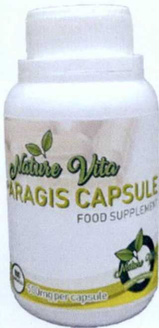
Figure 2. Unregistered NATURE VITA Paragis Capsule Food Supplement