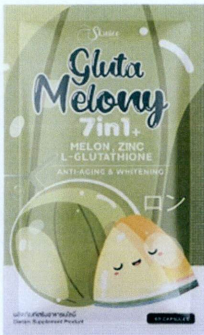
Figure 4. Unregistered SKINICE GLUTA MELONY 7in1+Melon, Zinc, L-Glutathione