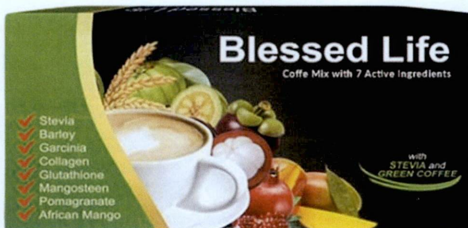
Figure 1. Unregistered BLESSED LIFE Coffee Mix 7 Active Ingredients with Stevia and Green Coffee

The Food and Drug Administration (FDA) warns all healthcare professionals and the general public NOT TO PURCHASE AND CONSUME the following unregistered food product and food supplements: