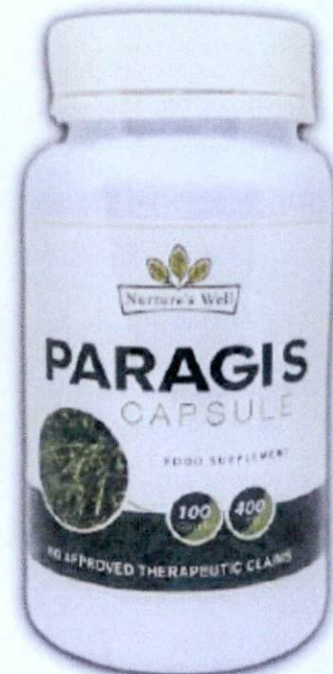
Figure 5. Unregistered NURTURE'S WELL Paragis Capsule