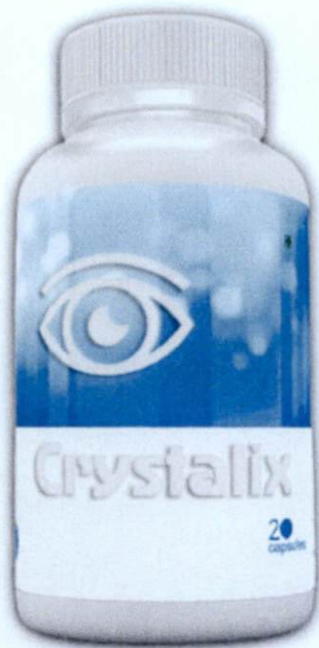
Figure 2. Unregistered CRYSTALIX