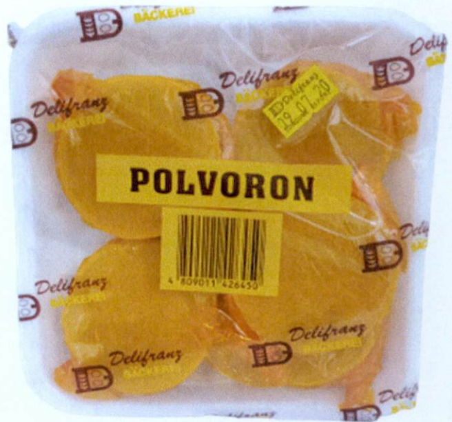
Figure 3. Unregistered DELIFRANZ BAKEREI Polvoron