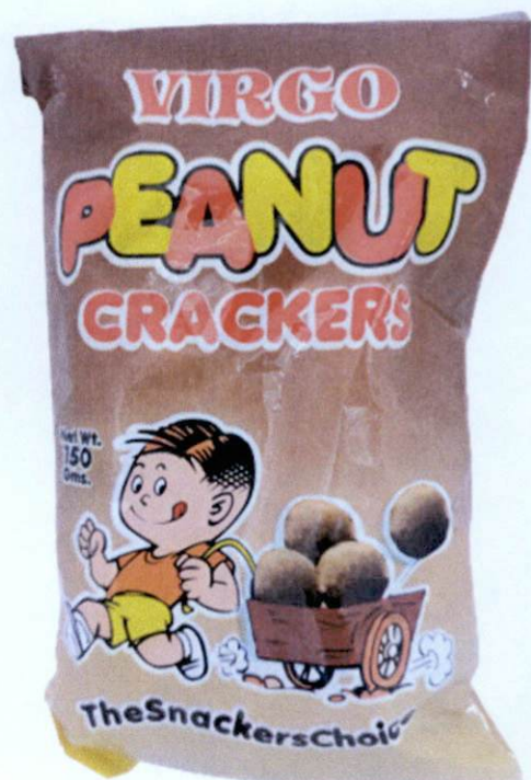
Figure 5. Unregistered VIRGO Peanut Crackers