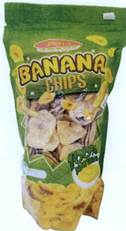
Figure 1. Unregistered JOCYL'S Banana Chips

The Food and Drug Administration (FDA) warns all healthcare professionals and the general public NOT TO PURCHASE AND CONSUME the following unregistered food products and food supplement: