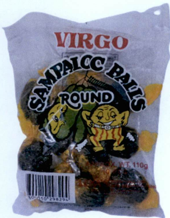
Figure 4. Unregistered VIRGO Sampaloc Balls Round