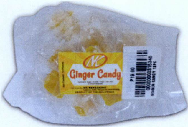
Figure 2. Unregistered NK Ginger Candy