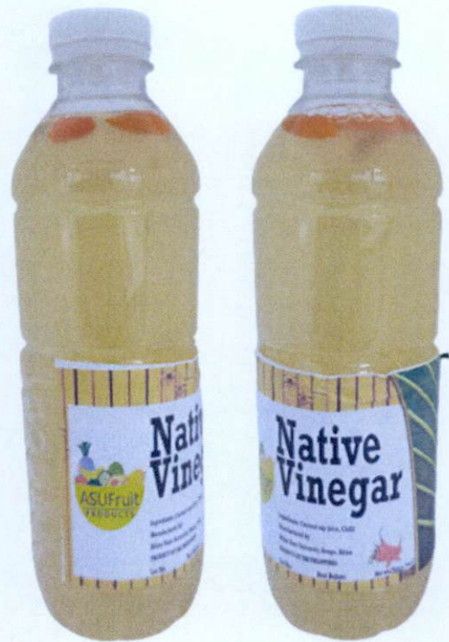
Figure 3. Unregistered ASU FRUIT PRODUCTS Native Vinegar