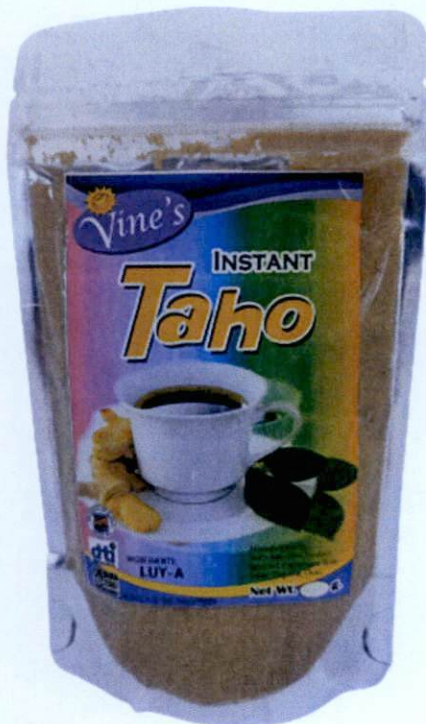
Figure 4. Unregistered VINE'S Instant Taho