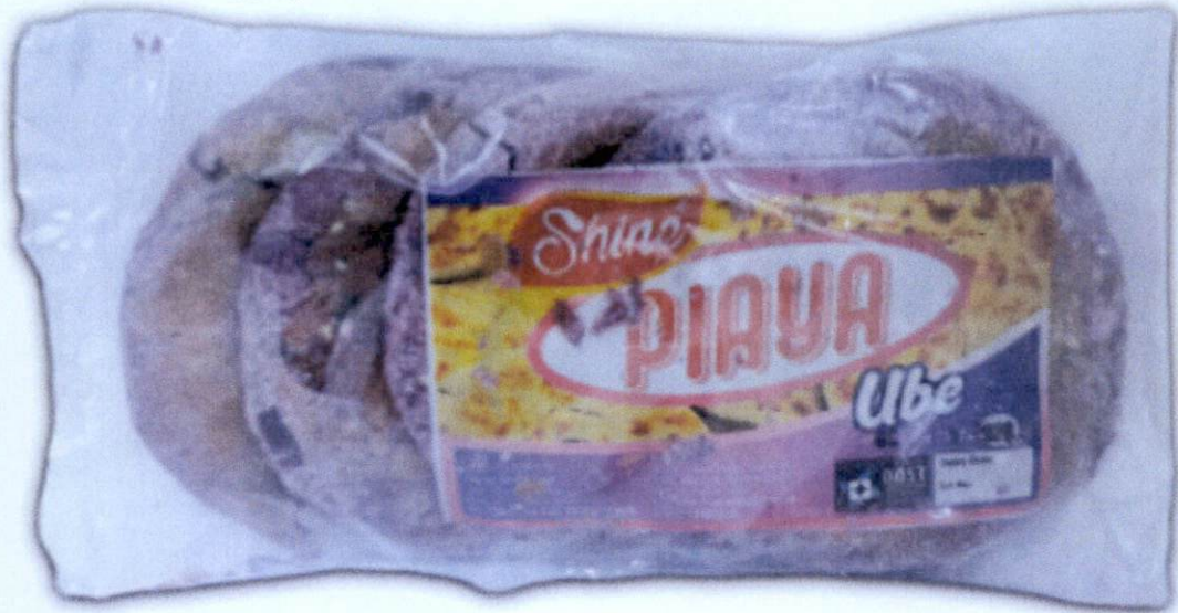
Figure 1. Unregistered SHINE Piaya Ube 5's

The Food and Drug Administration (FDA) warns all healthcare professionals and the general public NOT TO PURCHASE AND CONSUME the following unregistered food products: