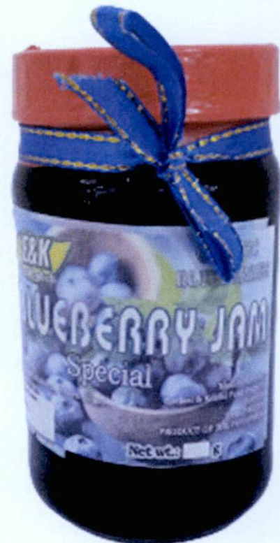
Figure 5. Unregistered E&K Blueberry Jam Special