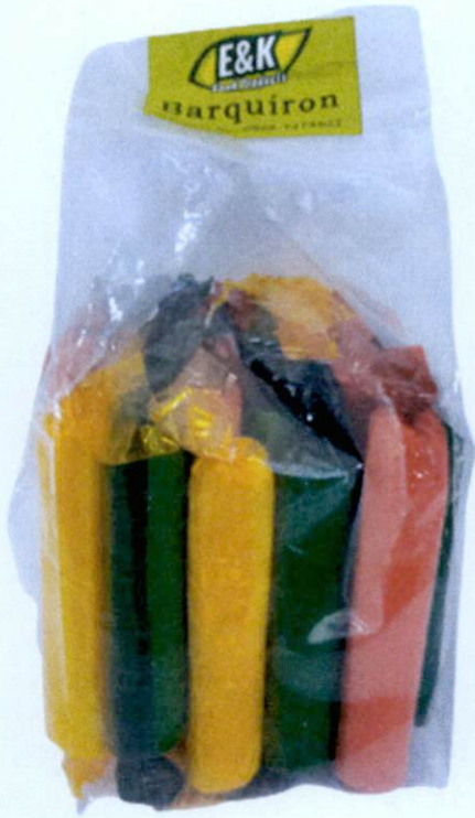
Figure 2. Unregistered E&K Barquiron