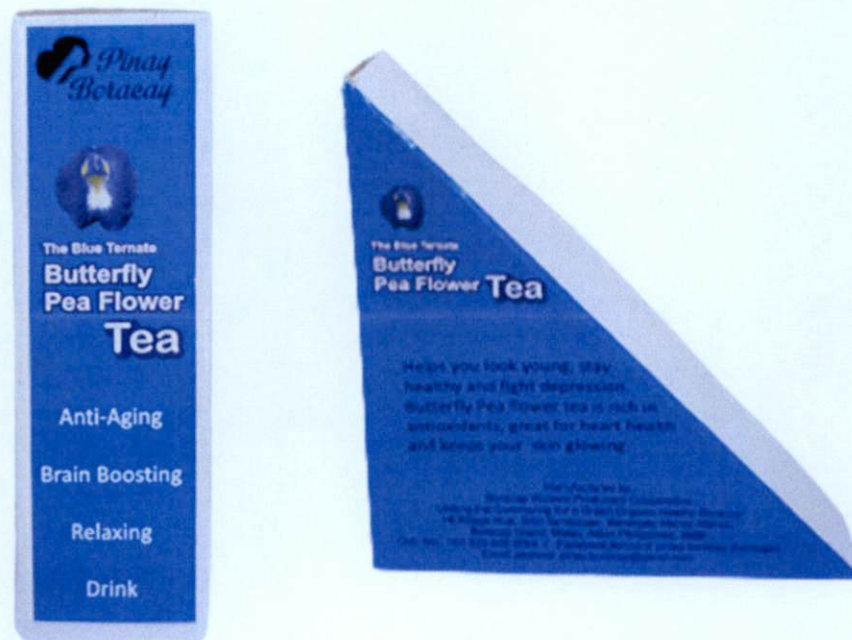
Figure 1. Unregistered PINAY BORACAY The Blue Ternate Butterfly Pea Flower Tea

The Food and Drug Administration (FDA) warns all healthcare professionals and the general public NOT TO PURCHASE AND CONSUME the following unregistered food products: