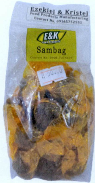
Figure 3. Unregistered E&K Sambag