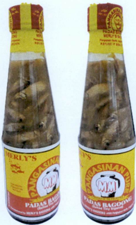
Figure 4. Unregistered MERLY'S Padas Bagoong