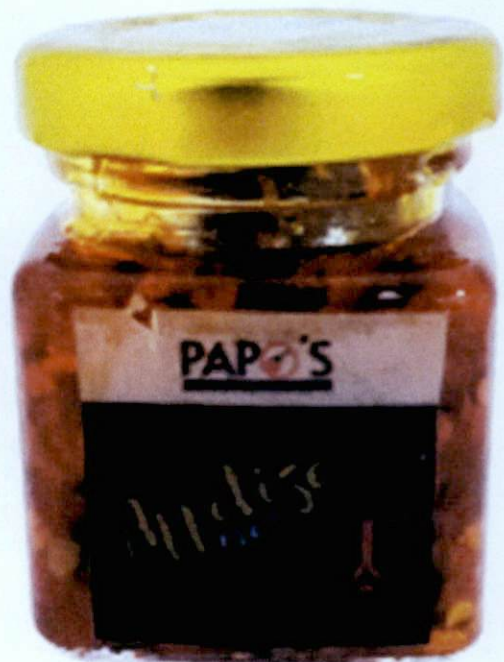
Figure 5. Unregistered PAPO'S Appetize Me