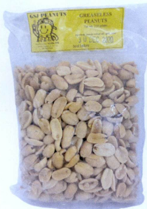
Figure 5. Unregistered GSJ PEANUTS Greaseless Peanuts