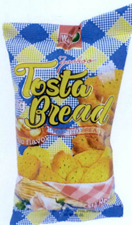
Figure 4. Unregistered WL FOODS Yaahoo Tosta Bread Toasted Bread Garlic