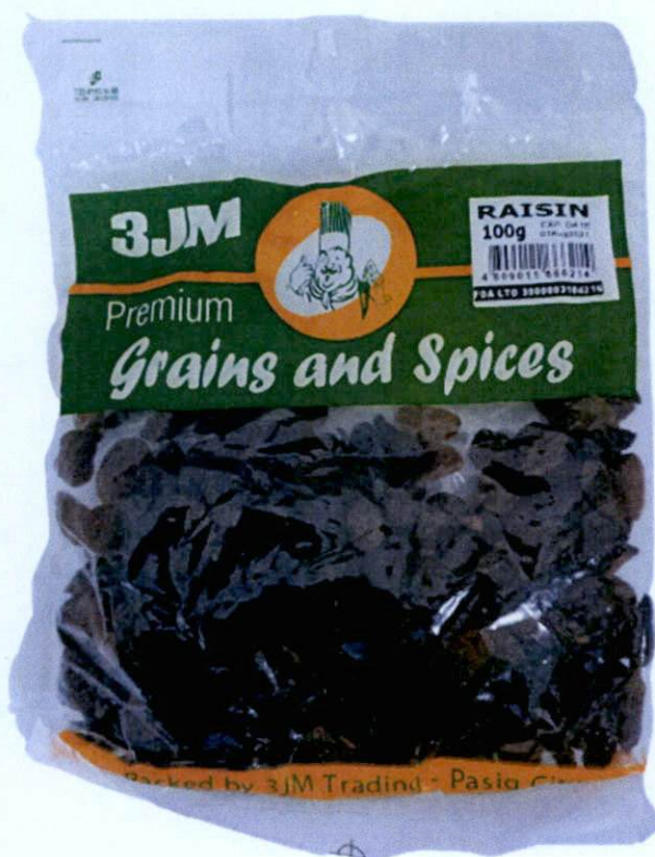
Figure 1. Unregistered 3JM GRAINS AND SPICES Raisins

The Food and Drug Administration (FDA) warns all healthcare professionals and the general public NOT TO PURCHASE AND CONSUME the following unregistered food products: