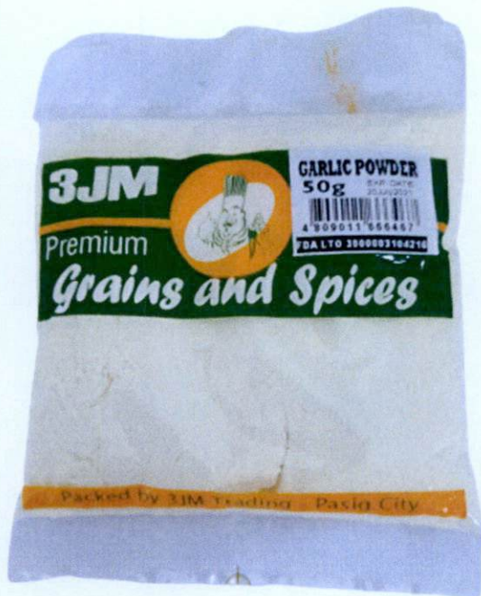
Figure 2. Unregistered 3JM GRAINS AND SPICES Garlic Powder