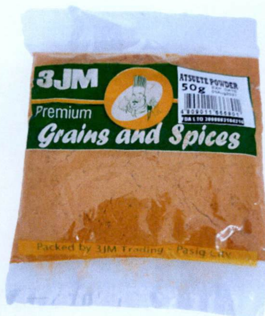
Figure 3. Unregistered 3JM GRAINS AND SPICES Atsuete