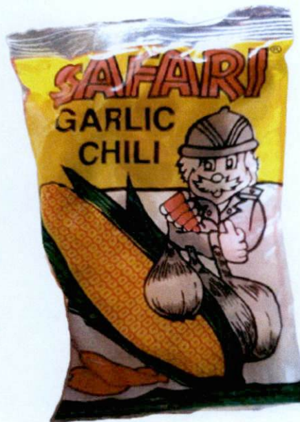
Figure 3. Unregistered SAFARI Garlic Chili