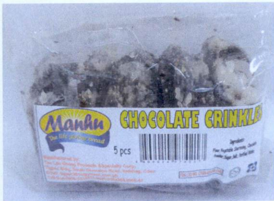
Figure 2. Unregistered MANHU THE LIFE GIVING BREAD Chocolate Crinkles