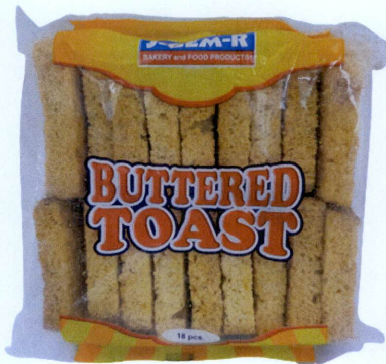
Figure 1. Unregistered J-GEM-R BAKERY AND FOOD PRODUCTS Buttered Toast

The Food and Drug Administration (FDA) warns all healthcare professionals and the general public NOT TO PURCHASE AND CONSUME the following unregistered food products: