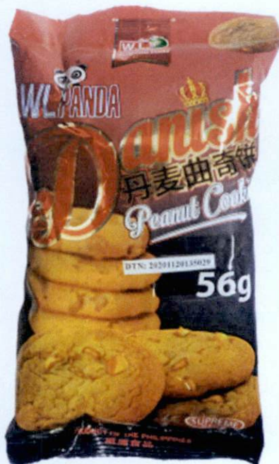
Figure 4. Unregistered WL PANDA Danish Peanut Cookies