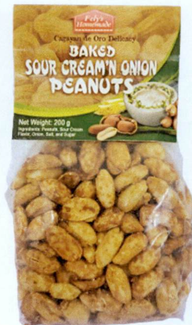
Figure 5. Unregistered FELY'S HOMEMADE Sour Cream 'N Onion Peanuts