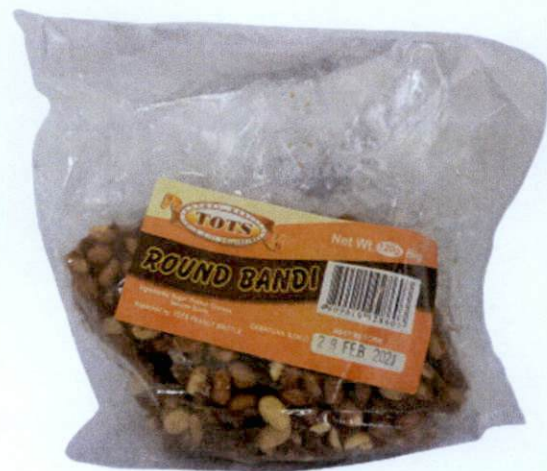
Figure 5. Unregistered TOTS Round Bandi