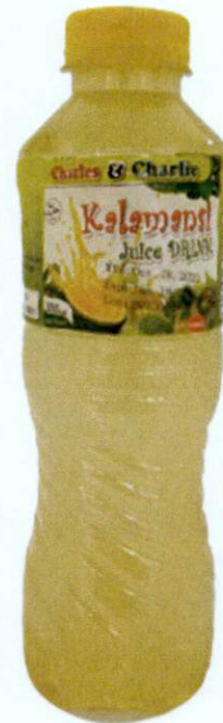
Figure 3. Unregistered CHARLES & CHARLIE Kalamansi Juice Drink