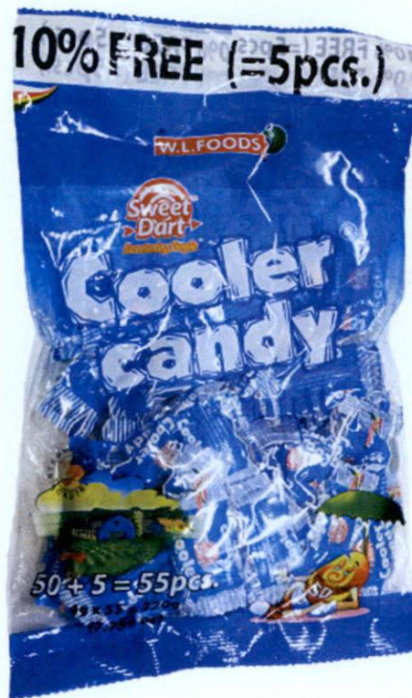
Figure 1. Unregistered WL FOODS Sweet Dart Sweetening People Cooler Candy

The Food and Drug Administration (FDA) warns all healthcare professionals and the general public NOT TO PURCHASE AND CONSUME the following unregistered food products: