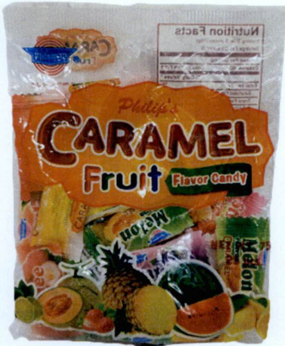
Figure 2. Unregistered PHILIP'S Caramel Fruit Flavor Candy