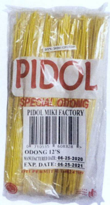
Figure 4. Unregistered PIDOL Special Odong