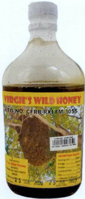
Figure 2. Unregistered VIRGIE'S Wild Honey