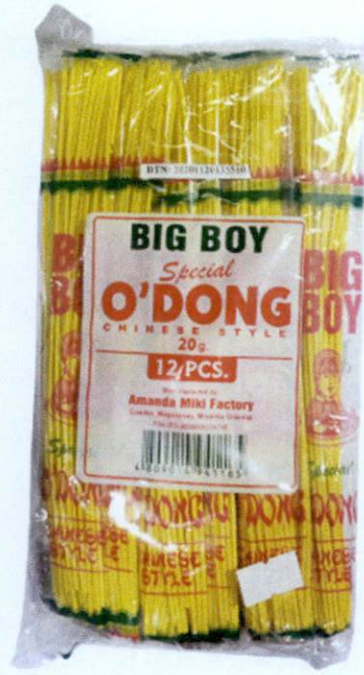
Figure 3. Unregistered BIG BOY Special Odong Chinese Style