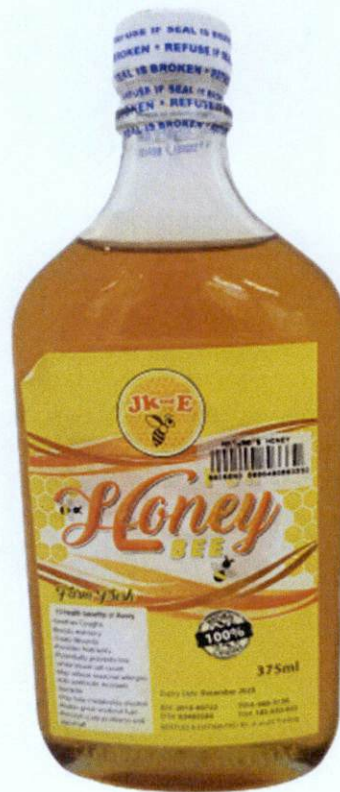
Figure 1. Unregistered JK & E Honey

The Food and Drug Administration (FDA) warns all healthcare professionals and the general public NOT TO PURCHASE AND CONSUME the following unregistered food products: