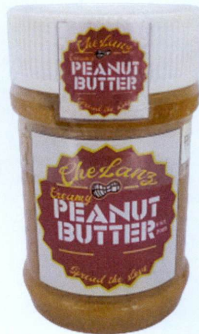
Figure 5. Unregistered CHE LANZ Creamy Peanut Butter