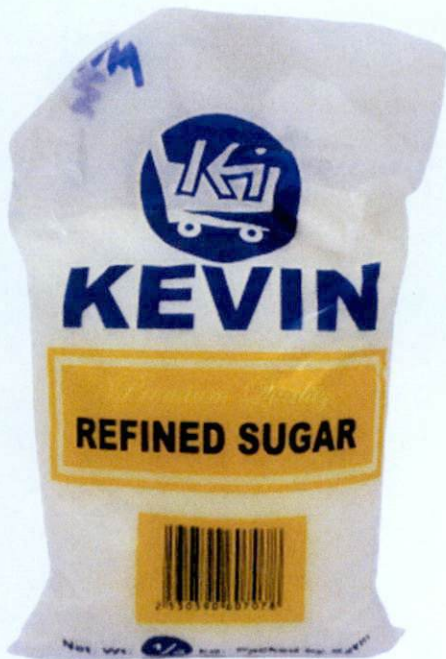
Figure 4. Unregistered KEVIN Premium Quality Refined Sugar