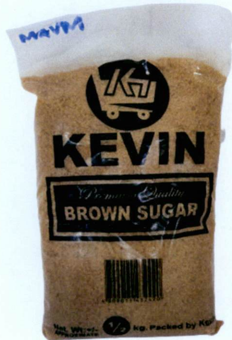
Figure 1. Unregistered KEVIN Premium Quality Brown Sugar

The Food and Drug Administration (FDA) warns all healthcare professionals and the general public NOT TO PURCHASE AND CONSUME the following unregistered food products: