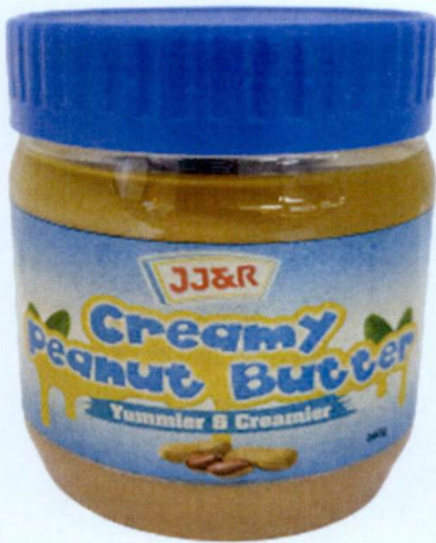
Figure 2. Unregistered JJ & R Creamy Peanut Butter