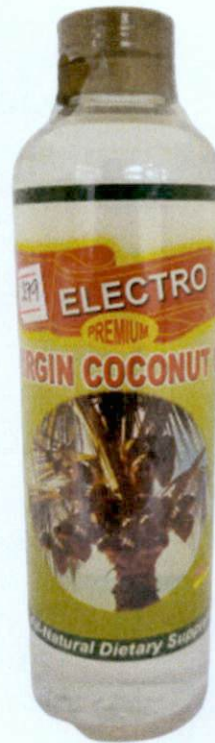
Figure 3. Unregistered ELECTRO PREMIUM Virgin Coconut Oil