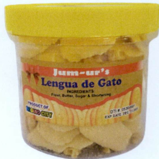
Figure 5. Unregistered JUM-UR'S Lengua de Gato