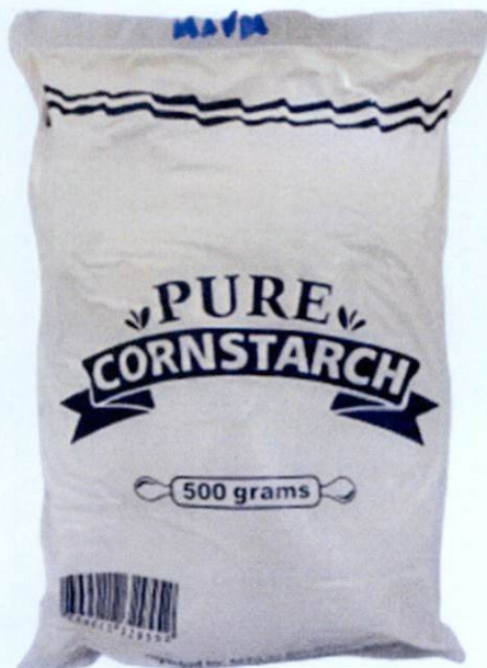
Figure 4. Unregistered UNBRANDED Pure Cornstarch