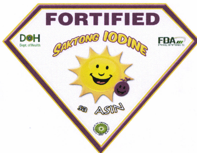
Figure 1. New Diamond Sangkap Pinoy seal for iodized salt: Adequately-iodized salt quality seal, also known as “Saktong Iodine sa Asin”

The adequately-iodized salt quality seal, dubbed as “Saktong Iodine sa Asin”, is developed mainly to strengthen and revitalize the existing DSPS used in the labels of iodized salt. This new adequately-iodized salt seal (Figure 1) aims to increase awareness and use of adequately-iodized salt in households and point of purchase. The quality seal will serve as guide to consumers in identifying and purchasing adequately-iodized salt.