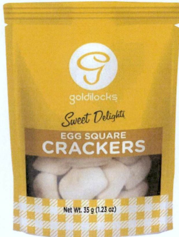
Figure 1. Approved label of GOLDILOCKS SWEET DELIGHTS Egg Square Crackers, FR-4000007648065 issued on 19 April 2021 valid until 19 April 2026

The Food and Drug Administration (FDA) informs the public that the food product GOLDILOCKS SWEET DELIGHTS Egg Square Crackers has been registered by the Market Authorization Holder (MAH) GOLDILOCKS BAKESHOP, INC. in accordance to existing FDA rules and regulations.