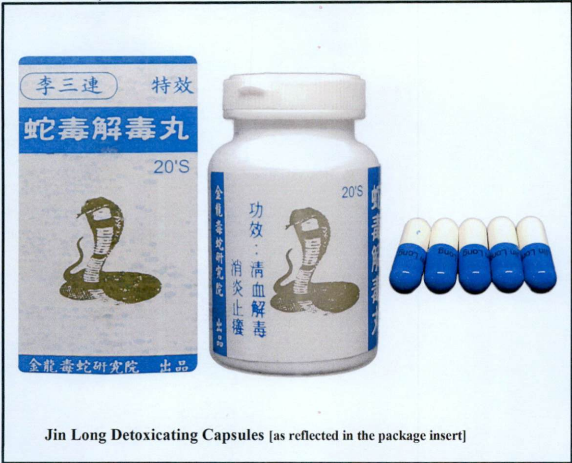
Jin Long Detoxicating Capsules [as reflected in the package insert]