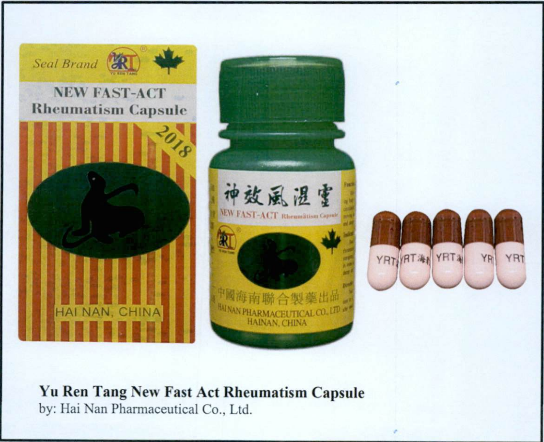
Yu Ren Tang New Fast Act Rheumatism Capsule by: Hai Nan Pharmaceutical Co., Ltd.