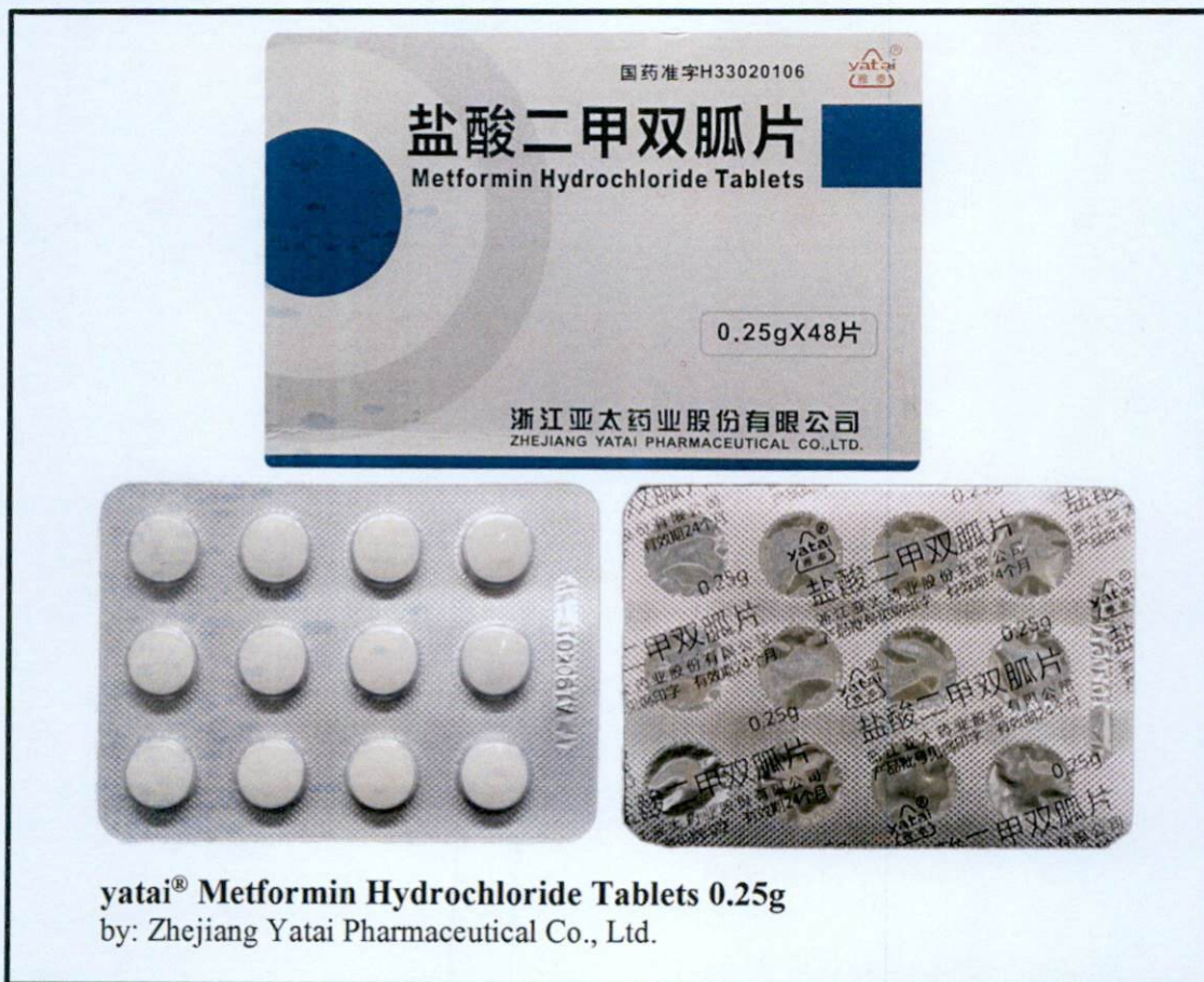
yatai® Metformin Hydrochloride Tablets 0.25g by: Zhejiang Yatai Pharmaceutical Co., Ltd.

The Food and Drug Administration (FDA) advises the public against the purchase and use of the following unregistered drug products: