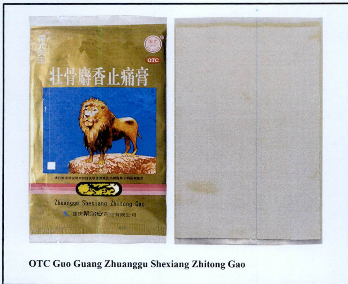
OTC Guo Guang Zhuanggu Shexiang Zhitong Gao

The Food and Drug Administration (FDA) advises the public against the purchase and use of the following unregistered drug products: