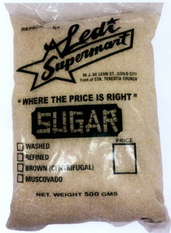
Figure 5. Unregistered LEDI SUPERMART Sugar (Brown Sugar)