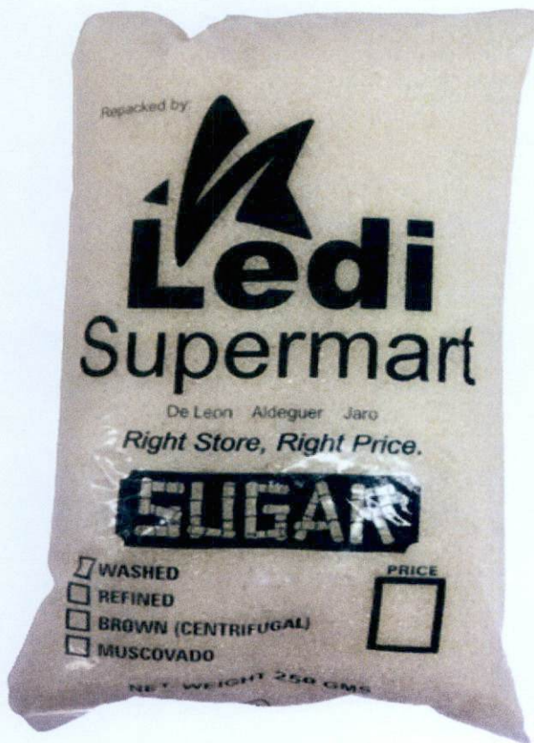
Figure 4. Unregistered LEDI SUPERMART Sugar (White Sugar)