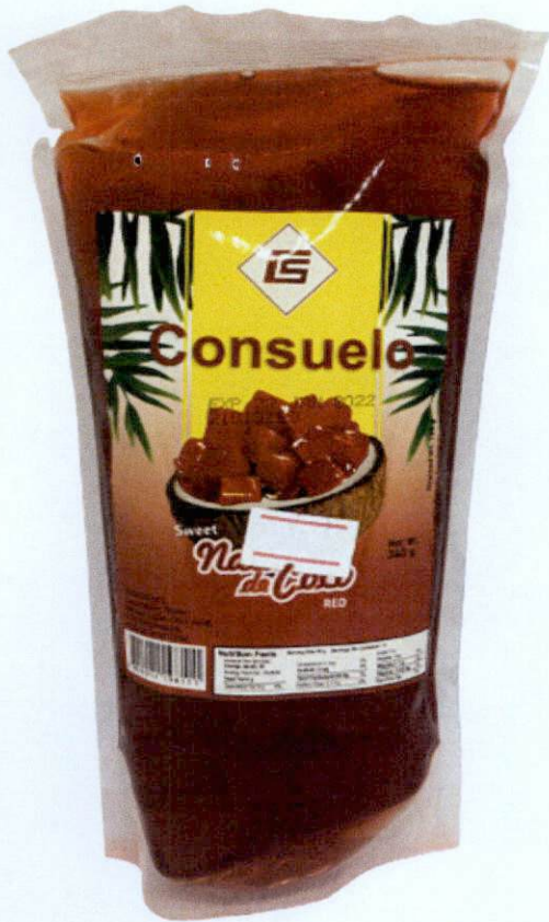
Figure 2. Unregistered CONSUELO Sweet Nata de Coco Red