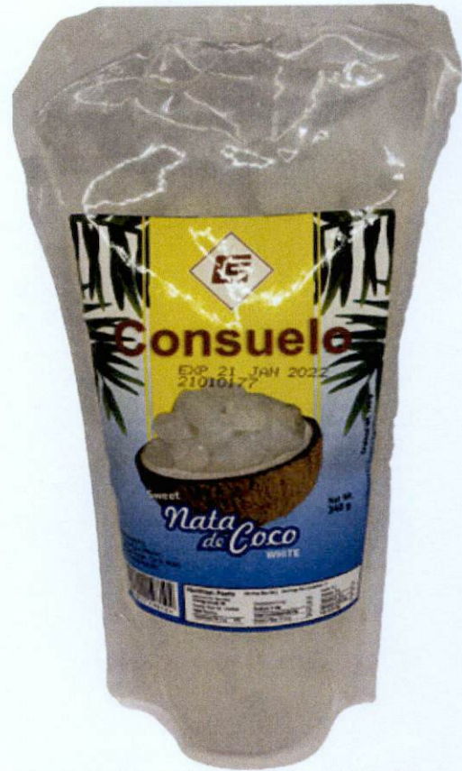
Figure 3. Unregistered CONSUELO Sweet Nata de Coco White