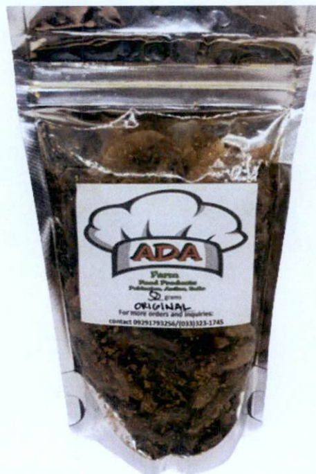
Figure 1. Unregistered ADA FARM FOOD PRODUCTS Fried Shrimp-Original

The Food and Drug Administration (FDA) warns all healthcare professionals and the general public NOT TO PURCHASE AND CONSUME the following unregistered food products: