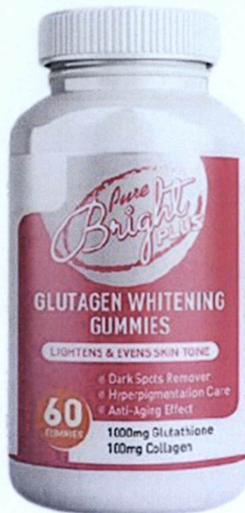
Figure 1. Unregistered PURE BRIGHT PLUS Glutagen Whitening Gummies

The Food and Drug Administration (FDA) warns all healthcare professionals and the general public NOT TO PURCHASE AND CONSUME the following unregistered food supplement and food products: