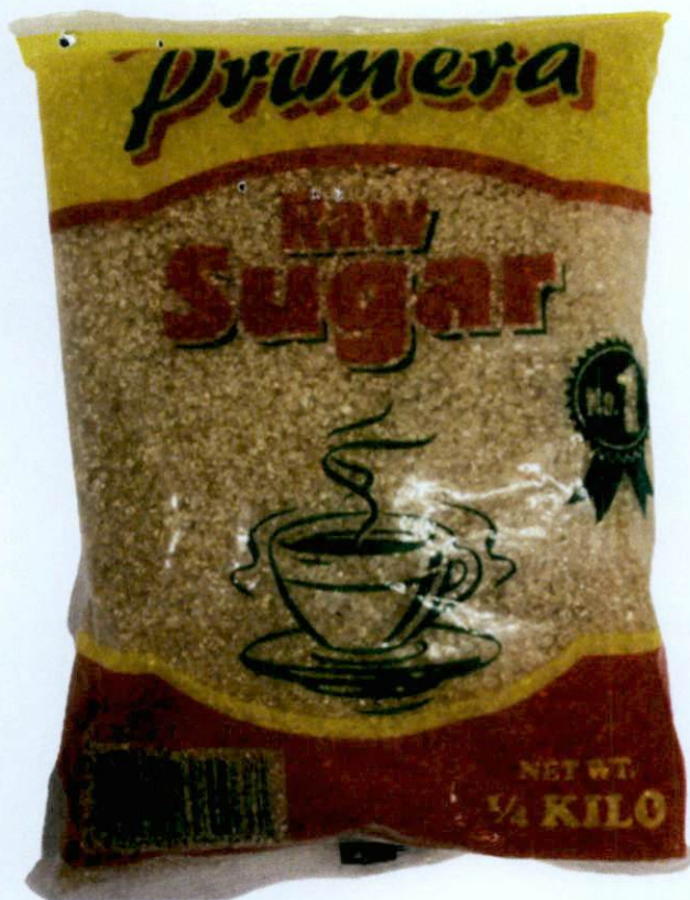
Figure 2. Unregistered PRIMERA Raw Sugar