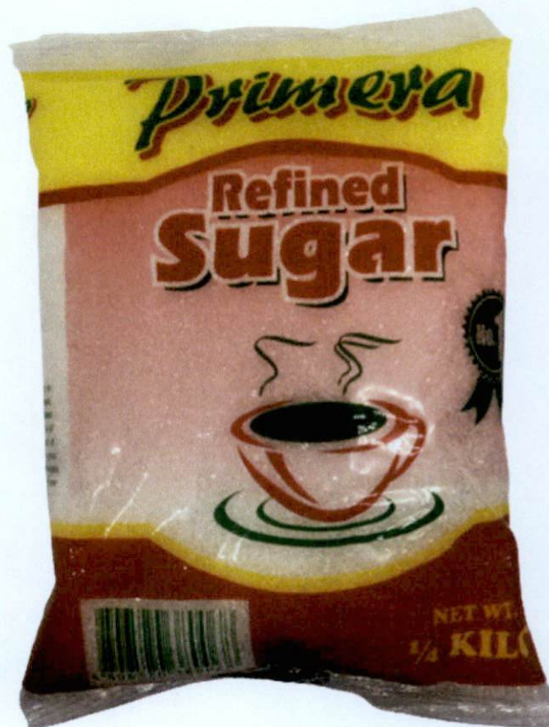
Figure 3. Unregistered PRIMERA Refined Sugar