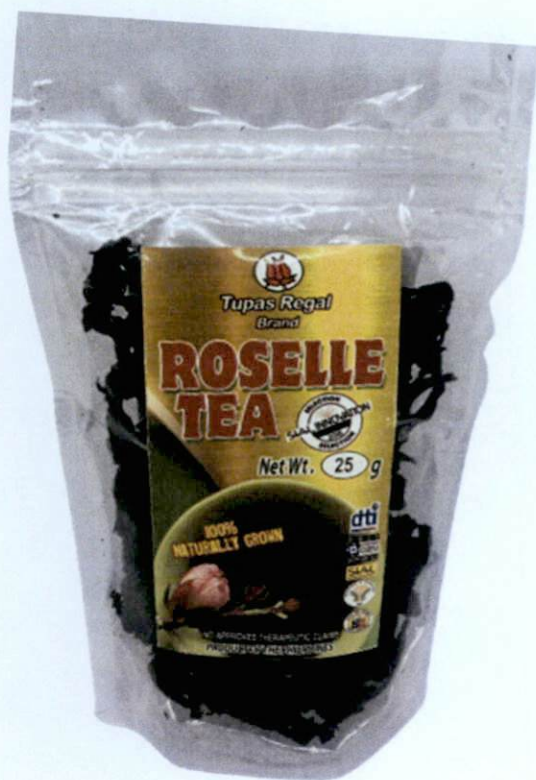
Figure 4. Unregistered TUPAS REGAL BRAND Roselle Tea