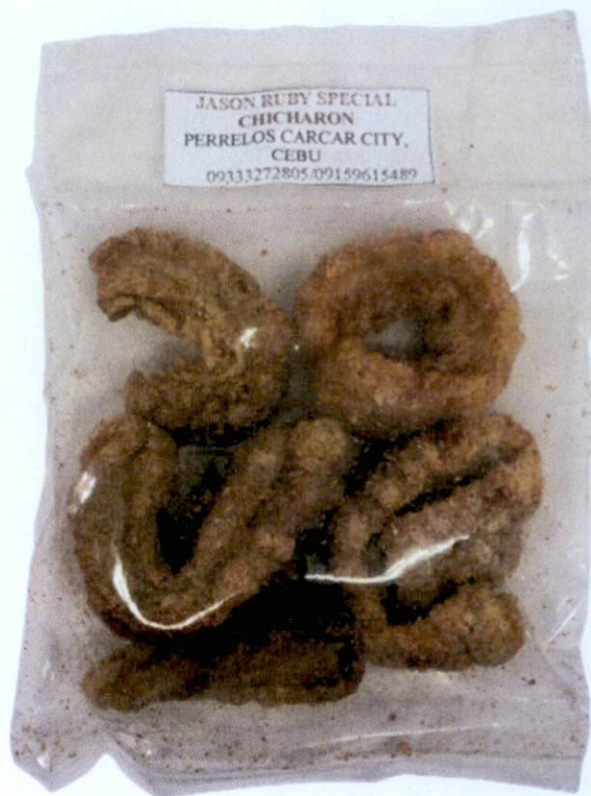
Figure 5. Unregistered JASON RUBY Special Chicharon