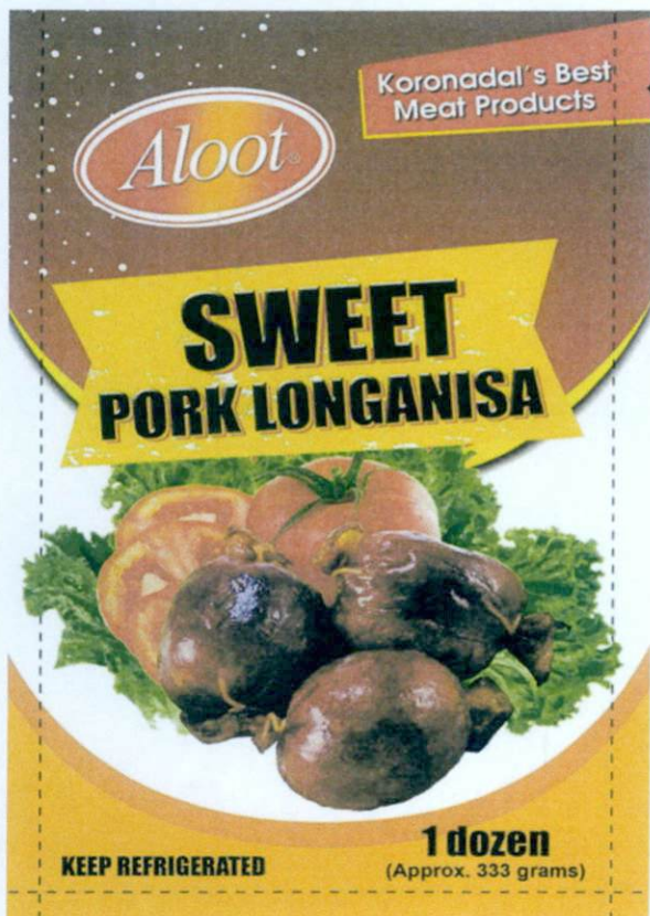
Figure 4. Unregistered ALOOT Sweet Pork Longganisa