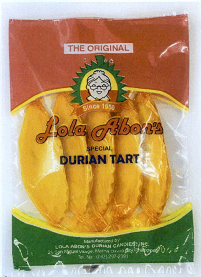
Figure 2. Unregistered LOLA ABON'S Special Durian Tart