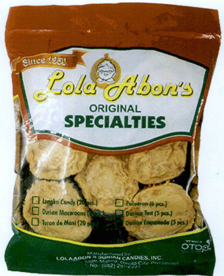
Figure 3. Unregistered LOLA ABON'S Original Specialties