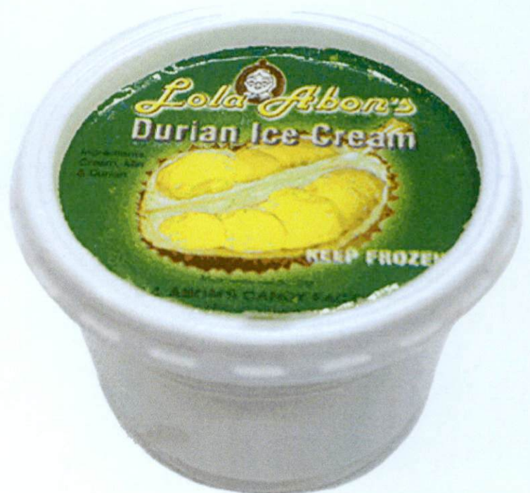
Figure 5. Unregistered LOLA ABON'S Durian Ice Cream