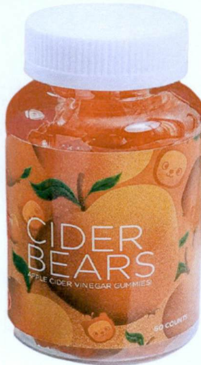
Figure 1. Unregistered CIDEBEARS Apple Cider Vinegar Gummies

The Food and Drug Administration (FDA) warns all healthcare professionals and the general public NOT TO PURCHASE AND CONSUME the following unregistered food supplement and food products: